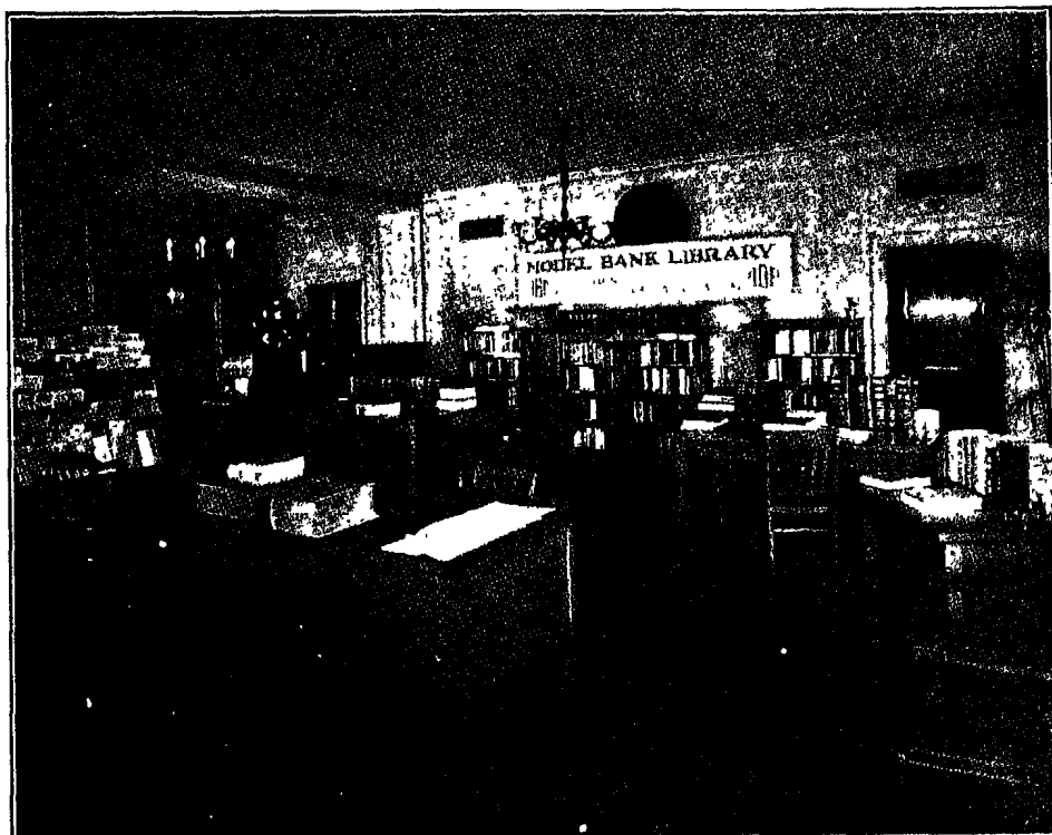
MODEL FINANCIAL LIBRARY EXHIBIT AT CLEVELAND