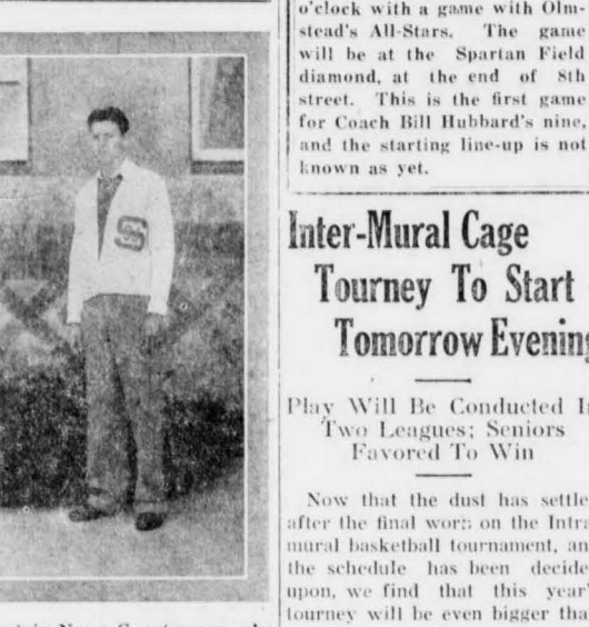
on tonight when they meet