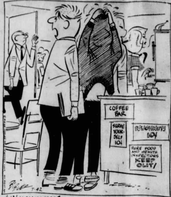
"WHAT'S MATTER? YA CUT HIS CLASS AGAIN?"