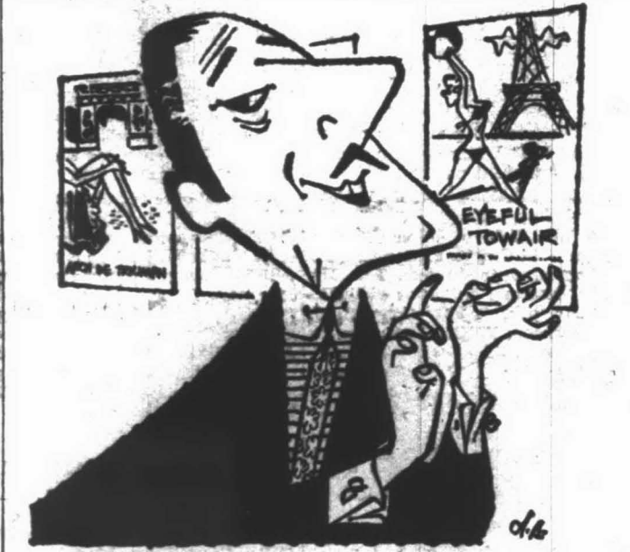
Dr. Ouvrez La Porte, popular French professor, says

"For ze comfort most agreeable, cherchez le Shorts Jockey!"