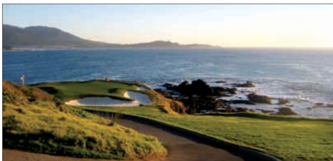
View of the Pebble Beach Golf Course on Thursday evening.