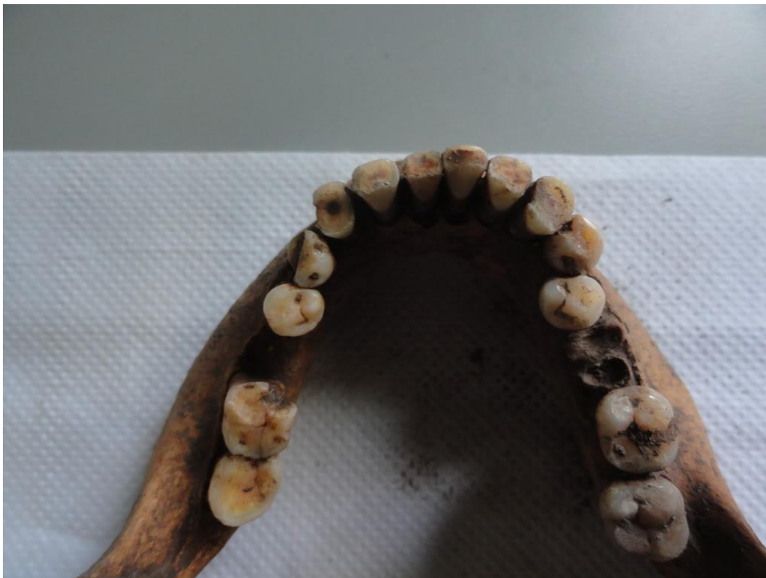
Fig. 9: Taoüa's mandible, Occlusal view. Possible carious lesion on left canine.

consumed by the later inhabitants of the Lesser Antilles (Allaire 1997a; Larsen et al. 1991; Walker 1983; Weiss 2009). The presence of carious lesions also provides more evidence of Taoüa being an agriculturalist, as caries tend to increase with the introduction of agriculture (Larsen et al. 1991; Weiss 2009). Of course, with the overabundance of support for an agriculturalist society for the time, some carious lesions are to be expected (Allaire 1997a; 1997b; Petersen 1997, Siegel 1996; Wilson 1989).