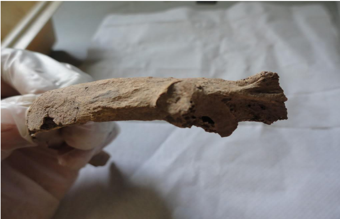
Fig. 18: Right rib, vertebral end extensive remodeling indicative of extensive use.

As mentioned previously, fishing, canoe-building, naval warfare and maritime trade were all essential to the proper functioning of Carib society, and while males were generally doing the most maritime trade (i.e. warfare or trade), there is no reason to assume that women were not travelling by ocean with some frequency (Petersen 1997; Petitjean-Roget 1961; Walker 1983; Watters 1997). However, most of the remodeling is seen on the medial left side of Taoüa's ribcage, possibly indicative of a pathology or trauma from a fall, especially when considered the extensive OA and remodeling seen on Taoüa's cervical and thoracic vertebrae (Ubelaker 1989; Weiss 2009).