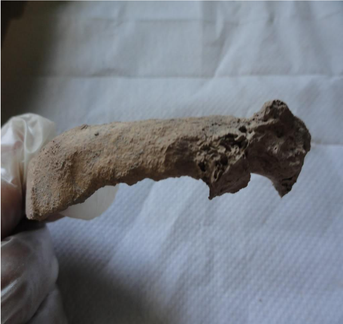
Fig. 17: Left rib, vertebral end. Notice the deformation, likely linked to the original cause of OA.