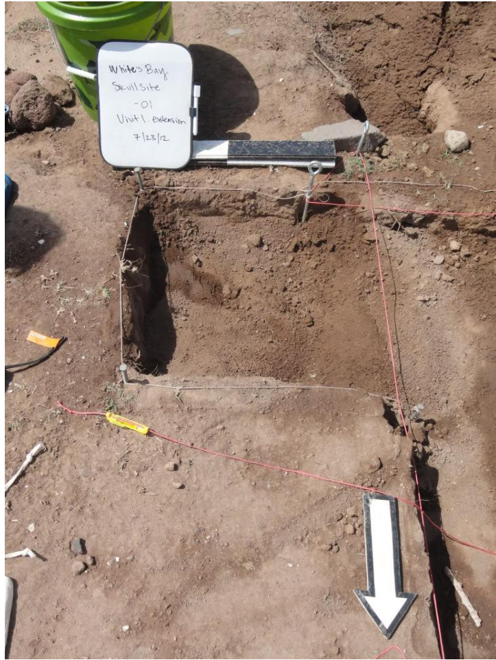
Fig. 4: WBS-01 extension, facing south, top of level 2.