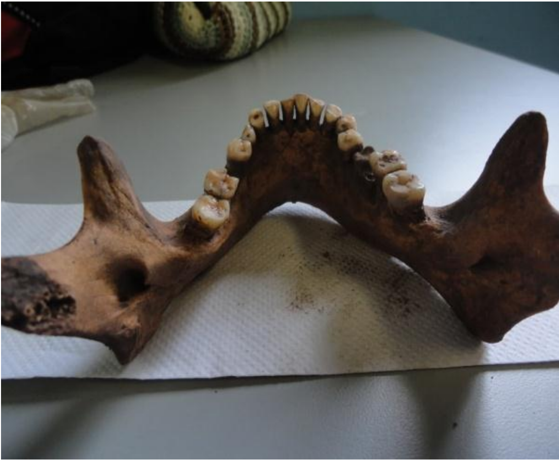
Fig. 11: Oblique view of mandible (right). Notice the lateral attrition between the incisors in both shots.