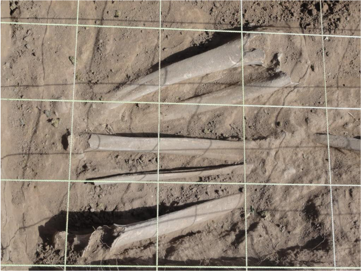
Fig. 5: Post-cranial elements revealed in WBS-01, extension.