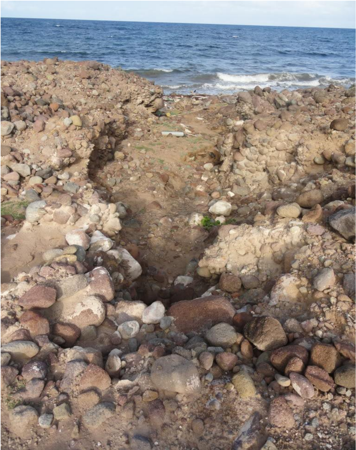
Fig. 1: An inland erosion cut into White Bay's beachfront that had evidence of flint knapping (e.g. sherds, flakes, proto-tools).