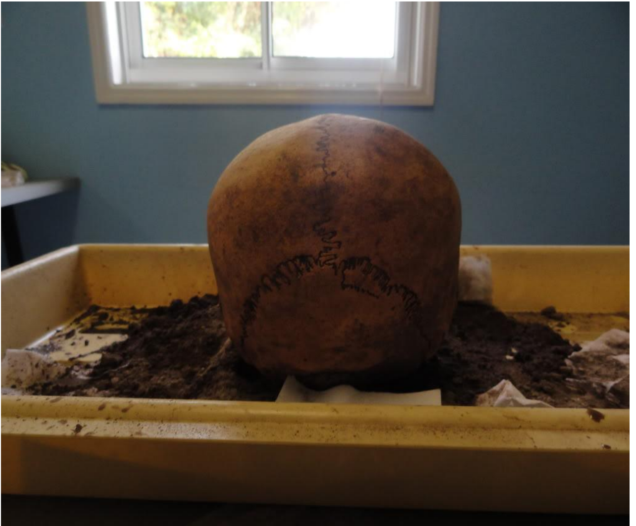
Fig. 13: Occipital flattening indicative of intentional fronto-occipital modification.