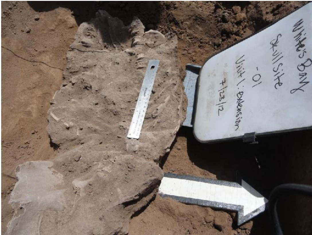
Fig. 6: Ribs, vertebra, and pelvic assemblage, pedestaled to preserve the integrity of the remains until we reached a proper lab setting (facing west).

While excavating WBS-01, some people had come out to observe us, and while wandering the area they discovered evidence of two more complete (though severely weathered and exposed) burials. The location of one nearby burial was pointed out by a site visitor and subsequently recorded. This site contained two more human burials, approximately 250m and 275m northeast, respectively, of the WBS-01 primary datum [see Fig. 7].