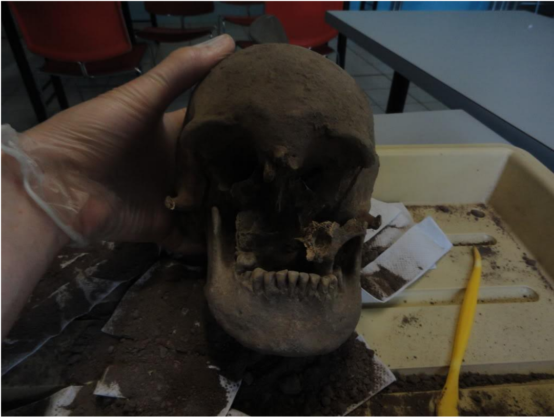
Fig. 14: Asymmetric orbital region is further indication of fronto-occipital modification.

Petitjean-Roget (1961) also found that a common cultural practice among the Caribs was to push on the nasal and forehead region of a newborn child, as well as the back of the head of a baby while nursing. This was done by mother to create a 'fierce' aspect; in fact, the Caribs even had a name for the practice, aterabae (Petitjean-Roget 1961: 48). This type of modification would have placed compressional forces along antero-posterior planes of the occipital and frontal regions of the cranial vault, possibly resulting in fronto-occipital deformation. In fact, Petitjean-Roget (1961) even mentions that it frequently caused asymmetrical growth of the brow and facial region, which