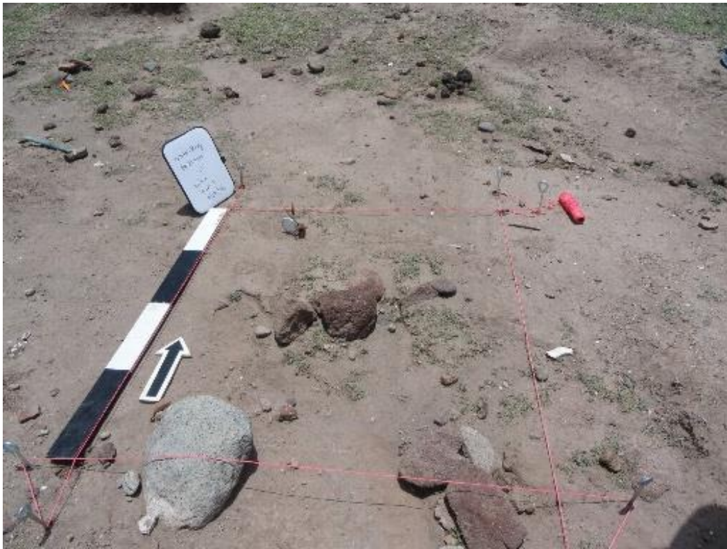
Fig. 2: WBS-01, facing north before breaking ground

than a hand trowel would not have been an effective instrument. Soft brushes and wooden clay working tools were used when in direct contact with bone, in order to prevent accidental damage. All excavated soil was screened through an 1/8in mesh, because we were working with small skeletal elements and possibly highly fragmented ceramics.