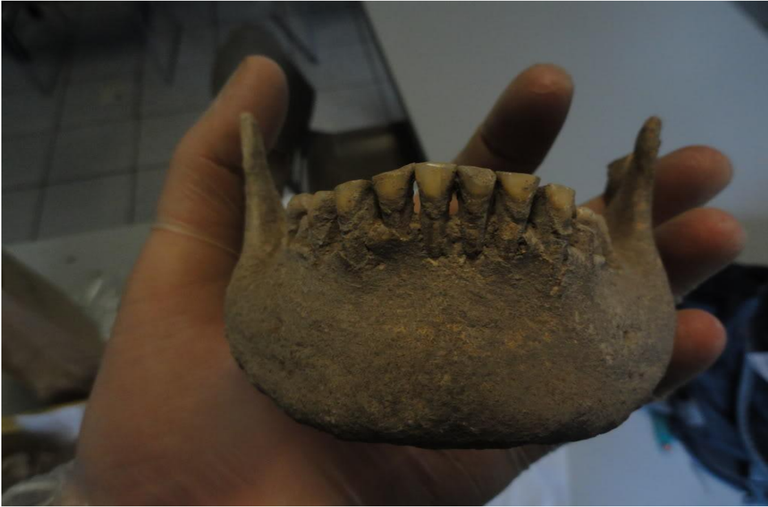
Fig. 10: Buccal view of lower incisors.