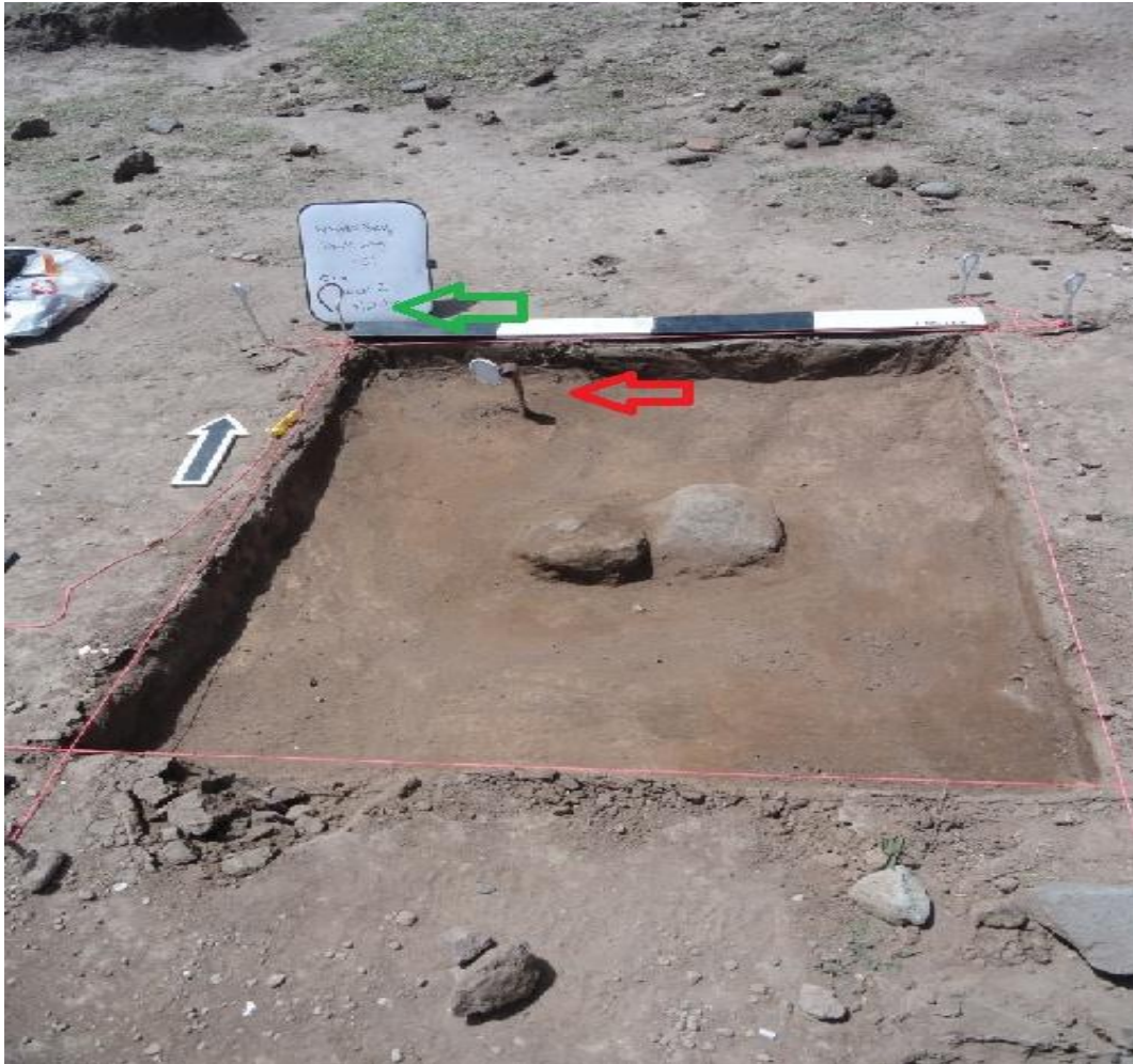
Fig. 3: WBS-01 unit facing north, level 1 before extension. The green arrow points to my team's primary datum, while the red arrow points to the 2011 team that excavated the cranium.

After almost two levels of near-complete sterility, we discovered a portion of what turned out to be a cervical vertebrae, near the southeastern wall of our unit; when, at 19 cm below datum (b.d.), we revealed a protruding humerus slightly further south, it was clear that the orientation of the remains was further south and east than previously thought. This, coupled with soil so culturally sterile it was likely backfill from the