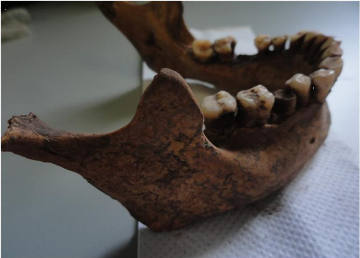
Fig. 8: Taouia's mandible, right side. Third molar has a significant carious lesion on the buccal side.

left canine [see Fig. 8]. Additionally, the antemortem loss of several teeth could have been due to caries, and the exposure of the dental root could have led to blood poisoning and Taouia's death, though it was not possible to determine her actual cause of death.