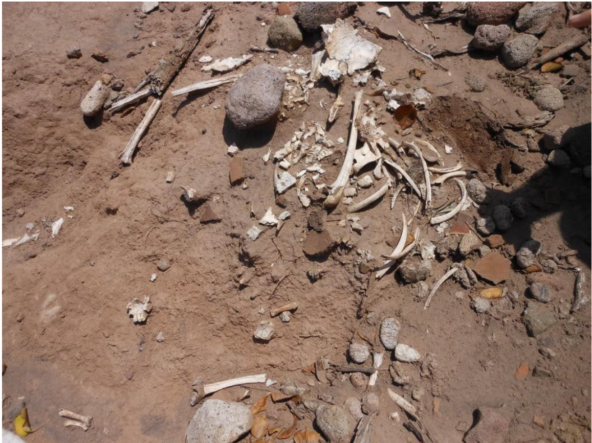
Fig. 7: Site of a second burial, severely damaged and largely exposed to the surface.

A more structured pedestrian survey was conducted in 2013 by the field school crew of the Morgan Slave Village. Four transects were placed near the primary datum from WBS-01, and a fifth was placed approximately halfway between the second and third burials discovered in 2012. Out of the five transects sent out, only the 0-point transect, on a heading of 20°NE found human skeletal remains. Lauren and Bree discovered half a maxilla and associated cranial fragments of a single individual approximately 197m from the 0-point. The surface remains were scattered over an area of 2-3m and directly behind the remains was a massive cut caused by erosion of the