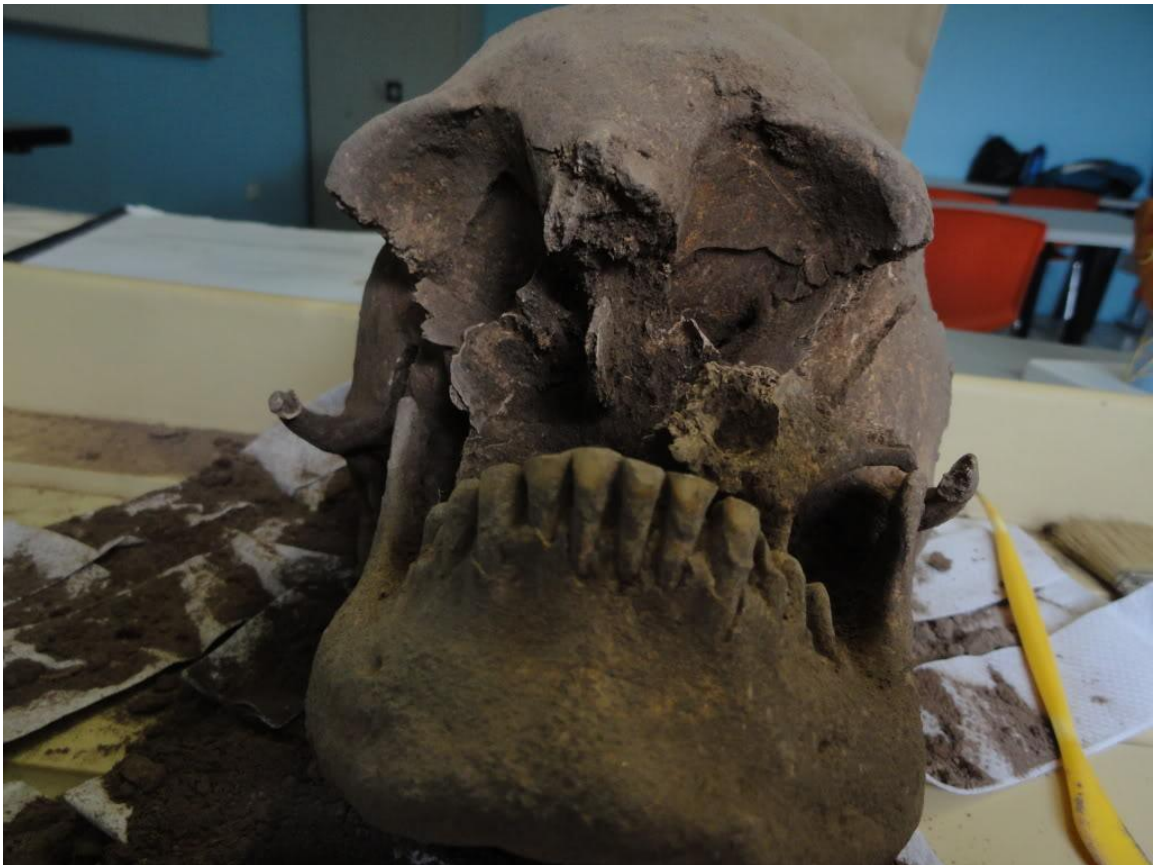
Fig. 12: Frontal shot, cranium.

right zygomatics [see Fig 12]. Additionally, portions of the palate existed though largely damaged, and most of the posterior portion of the cranium around the foramen magnum was also intact. This made certain measurements harder to take, most notably inter-orbital and the mid-facial measurements; however, the rest of the cranium was well enough preserved that were able to acquire some cranial measurements.