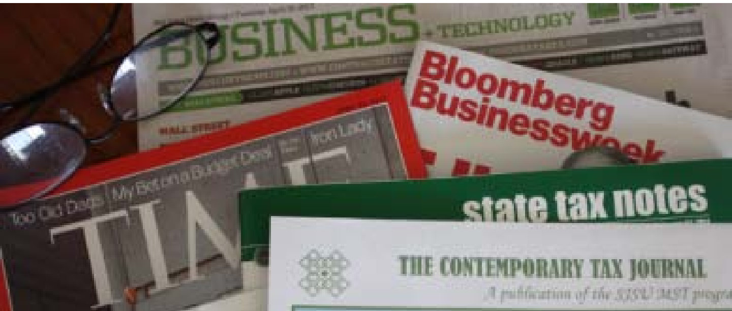
SJSU CTJ: If there is tax reform, what changes would you expect?