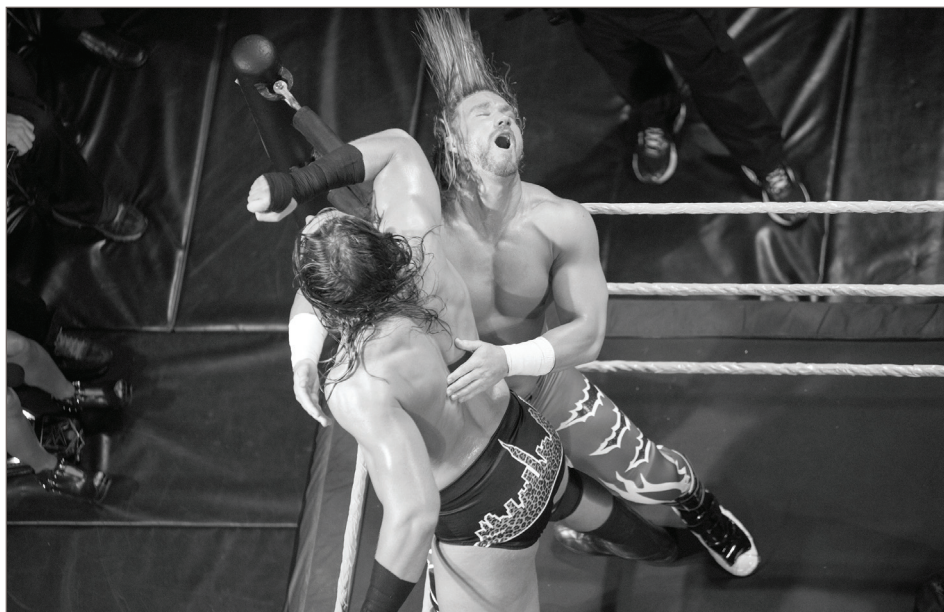
Photo by Brandon Chew | Spartan Daily Big Cass dishes out a series of nasty elbow jabs to Blake during WWE NXT on March 27.