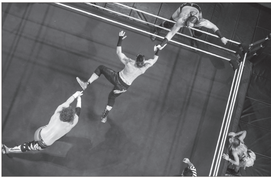
Crowd favorite Enzo Amore makes the hot tag to his partner Big Cass just before Murphy can stop him during WWE NXT on Friday, March 27.