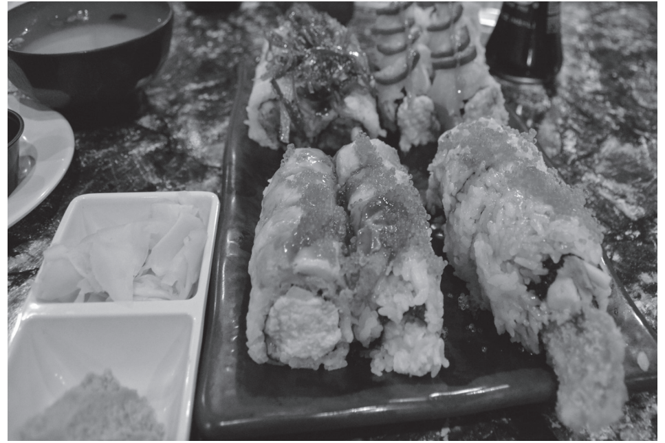
The animal style, mamacitta, Spiderman, and caterpillar rolls are just four of over three dozen sushi rolls made at Kenzo Japanese Restaurant on 5465 Snell Ave.

Both rolls were crammed with cream cheese which overpowered the flavor of the rolls.