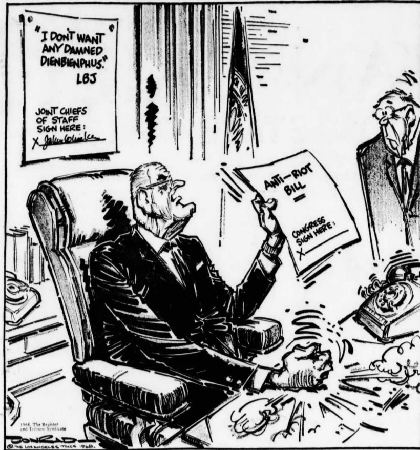
"I don't want any damned Detroit, Watts, or Newark either . . . !"

A simple, objective examination of the issues, pros and cons, as presented in Monday's story, will reveal which side possesses