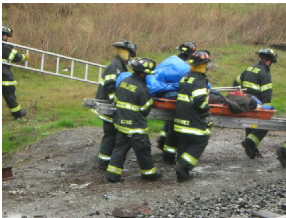
Figure 2 Firefighters Remove Equipment During a Multi-Agency Full-Scale Disaster Training Exercise in San José, California

At the final learning station the teams undergo rehabilitation, including hydration and snacks. They also participate in a brief refresher training on critical incident stress debriefings, and are then led by peer debriefers in a debriefing of the exercise experience. While the debriefers take notes, the individual contributions are kept confidential, as in a real event. Several times this debriefing has brought out echo effects from previous real- world events, enabling first responders to deal with the stress, or identify the need for professional counseling.