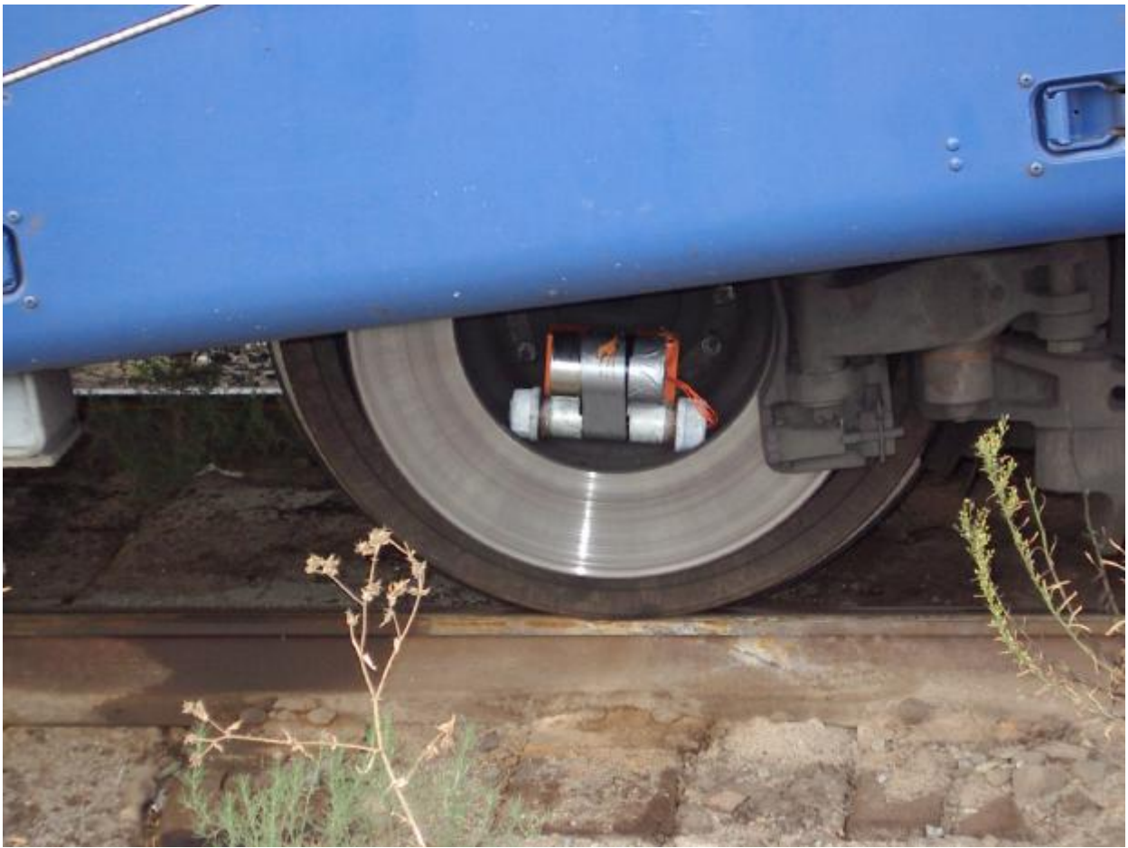
Figure 4 IED in a Rail Wheel During a Facilitated Exercise