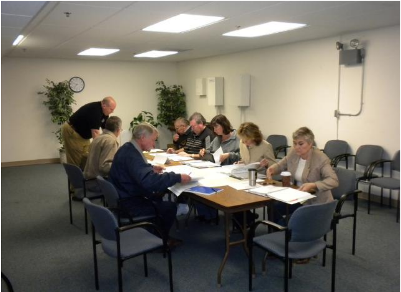
Figure 3 An Example of a Tabletop Exercise

Online information on the I-STEP program was available at the TSA website “what we do portion” ( http://www.tsa.gov/what_we_do/index.shtm ), which includes materials on security operations, layers of security and law enforcement. I-STEP details are found at http://www.tsa.gov/what_we_do/layers/istep/index.shtm . The Intermodal Security Exercise Training Program (I-STEP) is based on HSEEP and NIMS. Its purpose is to have various forms of surface transportation exercise together to prepare for a transportation terrorist-related incident. “The tools include advanced software for exercise design, evaluation and tracking for a mix of tabletop, advanced tabletop and functional exercises.” Information about the EXIS software is available at http://www.tsa.gov/assets/pdf/012908_exis_technical_sheet.pdf . The guidance depends on the user having the suite of HSEEP-related training, and the skill to use a software based exercise development tool.