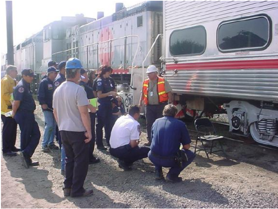
Figure 5 Participants in Facilitated Exercise Looking Under Railway Carriage