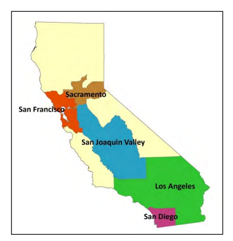
Figure 2. Map of California and Five Major Regions