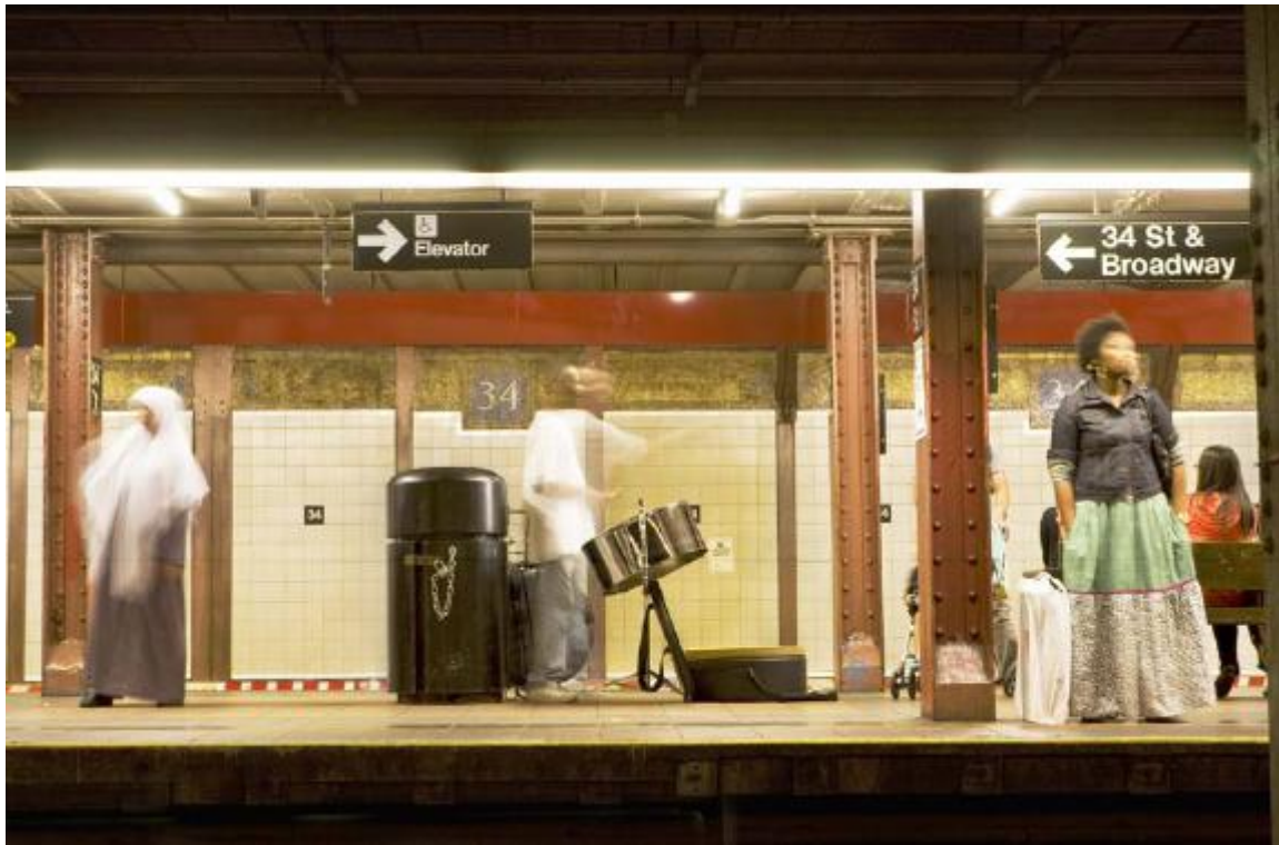
Figure 6. The 34th Street Herald Square Subway Station