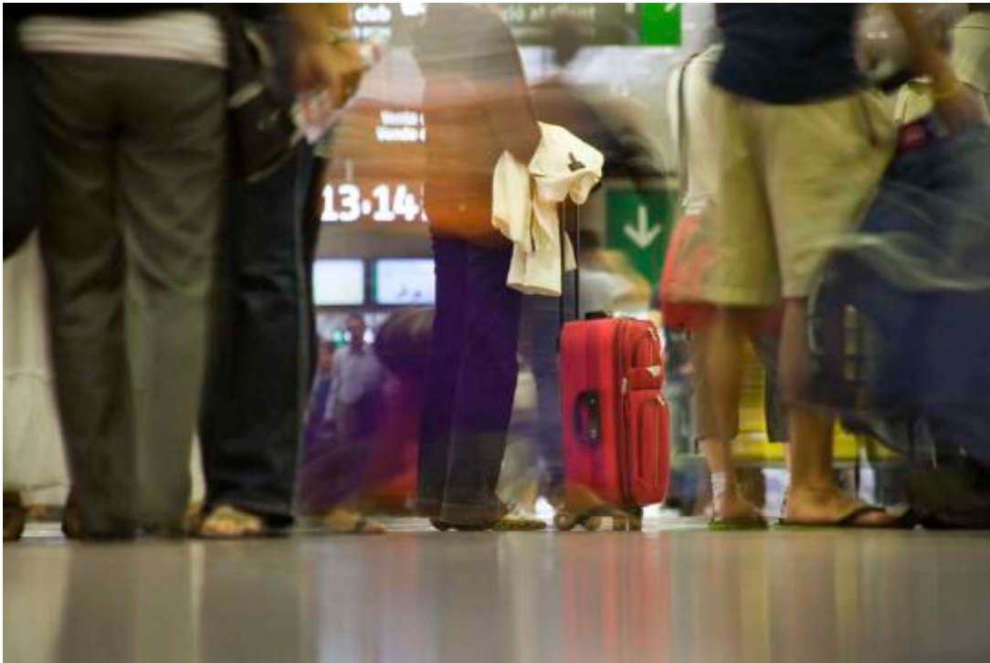
Figure 11. A Barcelona Metro Station