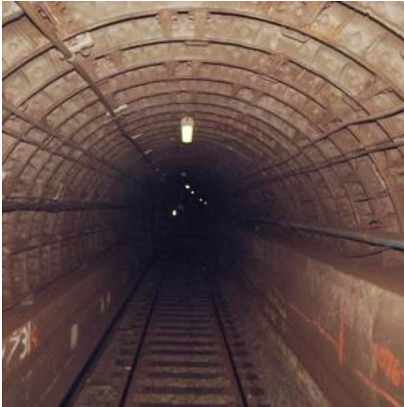
Figure 10. A PATH Tunnel Under the Hudson River

According to Lebanese authorities, a group of terrorists in Lebanon planned to detonate backpack bombs on Port Authority Trans-Hudson (PATH) trains while under the Hudson River between New Jersey and New York (Figure 10). The plotters discussed the amount of explosives required to breach the tunnel lining, which would flood the tunnel, underground stations in Lower Manhattan, and other below-sea-level tunnels.