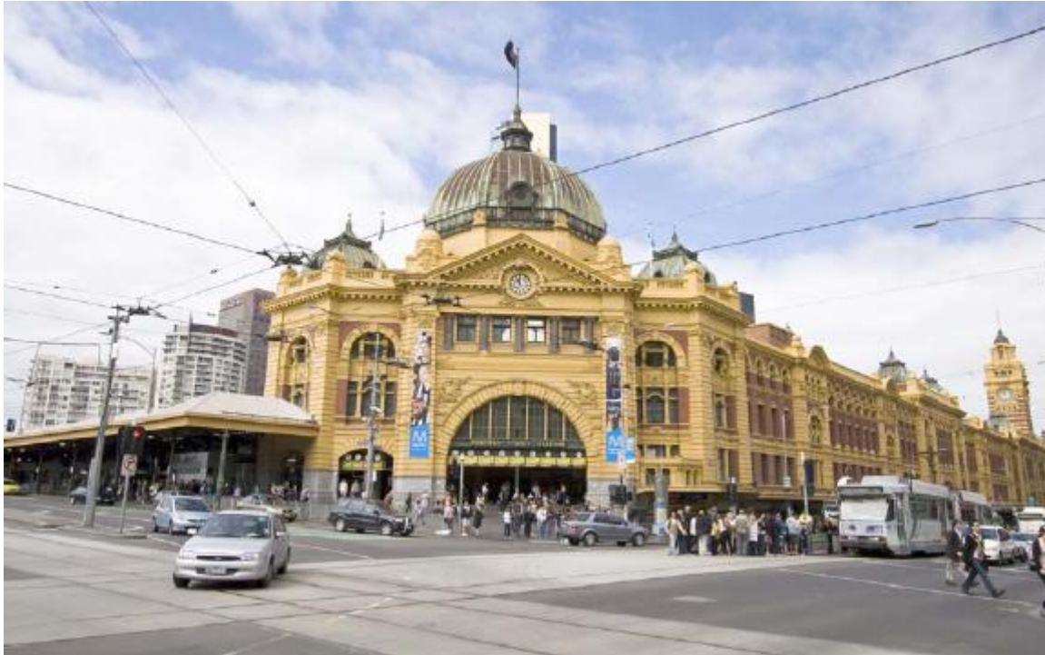
Figure 8. Flinders Street Station, Melbourne

the Melbourne headquarters of the Department of Foreign Affairs and the Department of Trade and Immigration, the Australian Stock Exchange, and the Manly Ferry Terminal. 74