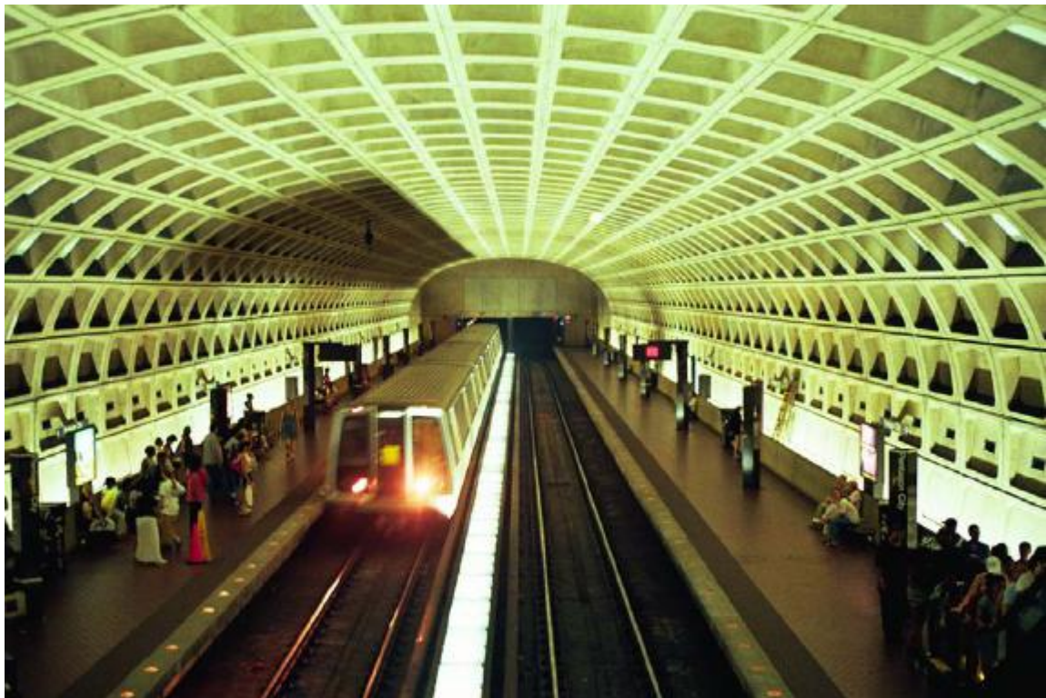
Figure 12. The Washington, D.C., Metro