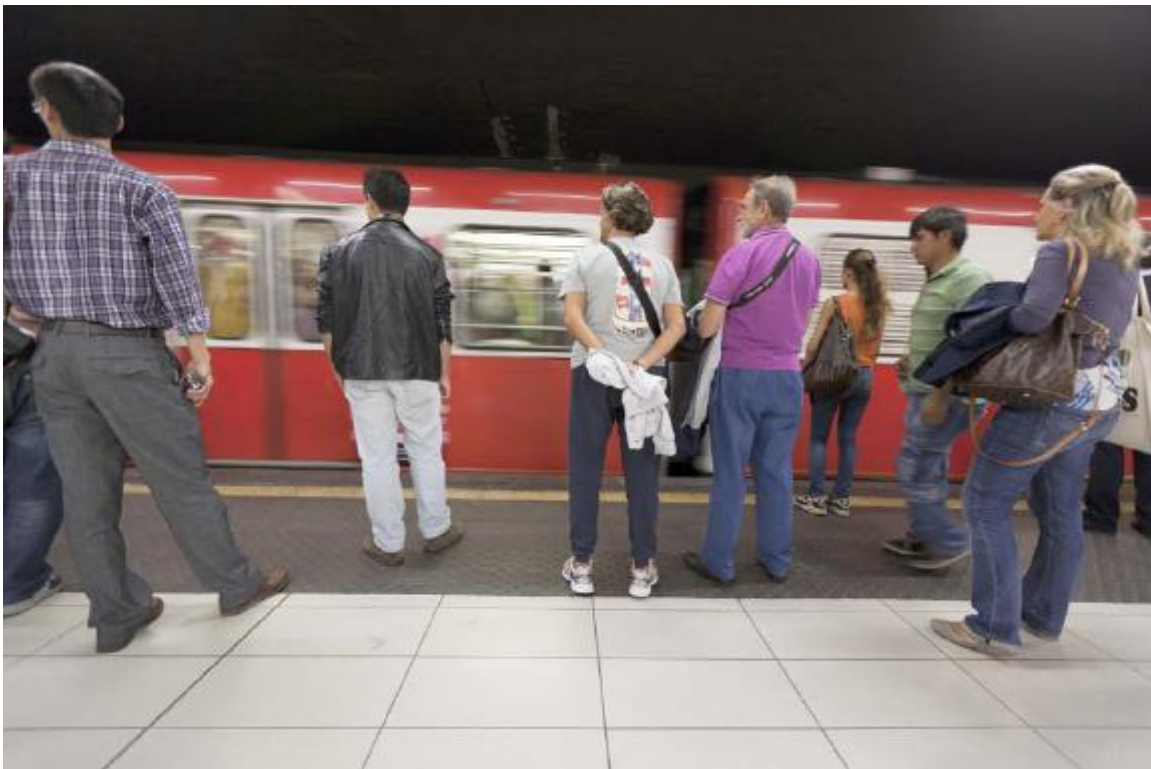
Figure 9. The Milan Metro

It is also possible that inspiration may have come from an arson attack on the Milan Metro carried out by Domenico Quaranta, a Sicilian street tough who converted to Islam while in prison, then recruited himself as a jihadist warrior and carried out a series of attacks between November 2001 and May 2002. On May 11, 2002, at 10:00 pm, he detonated an incendiary device at the Duomo Metro station in central Milan (Figure 9). The device failed, producing only smoke, but nonetheless caused considerable alarm.