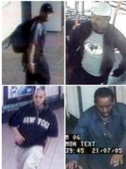
Figure 7. Surveillance Photos of the Bombers Entering the Station and Fleeing After Their Devices Failed

After the July 5 attack, security on London's Underground was extremely high. The London Tube is monitored by an extensive CCTV camera network, visible and undercover police patrols, and constant admonitions for the public to be alert and to report any suspicious activity to the authorities. In addition, authorities attempt to keep those suspected of involvement in terrorist activity under close surveillance (Figure 7).