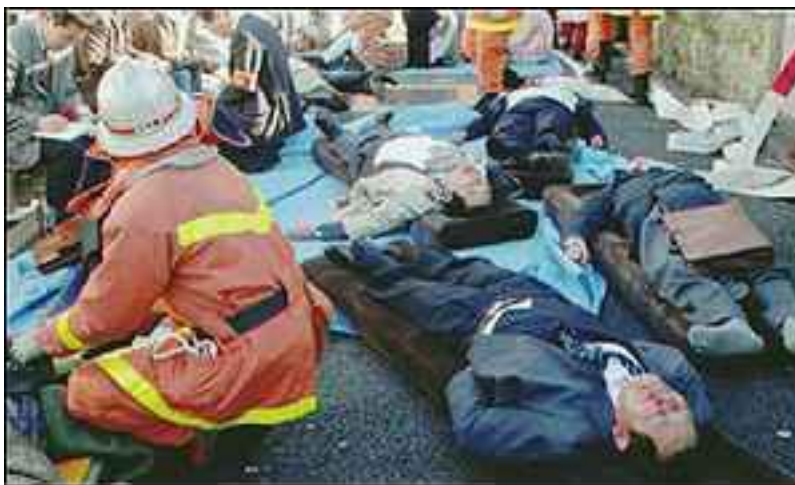
Figure 1. Victims of the 1995 Sarin Attack on Tokyo's Subway

Terrorists tend to be imitative and will try to replicate attacks (targets, tactics, techniques) that they consider successful. It is not possible to identify the source of inspiration or instruction for each of the 15 cases presented here, but some spectacular precedents are likely to have inspired them. Four of the plots involved chemical or biological substances (poison gas or ricin), and it seems highly likely that the plotters were inspired by the 1995 sarin attack in Tokyo in which terrorists dispersed nerve gas on Tokyo's subways, killing 12 people and sending more than 5,000 to hospitals (Figure 1).