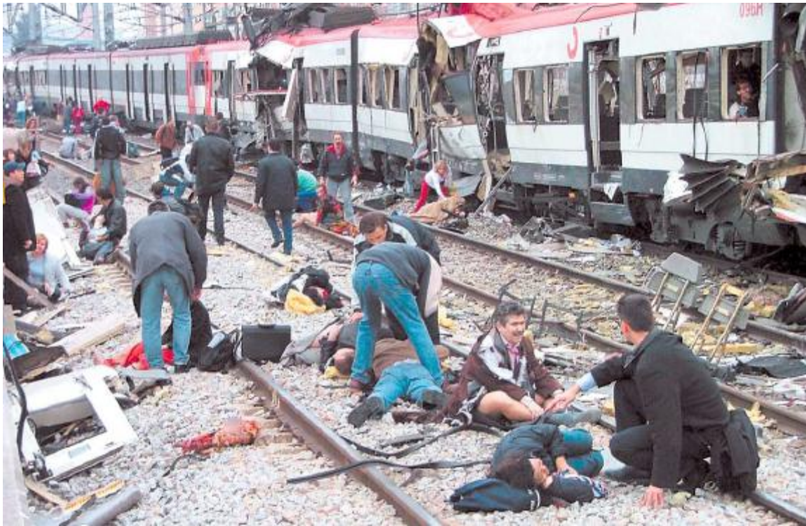
Figure 2. Aftermath of the March 11, 2004, Madrid Train Bombing

The Madrid bombings also inspired the London Transport bombings in July 2005, which in turn provided the template for the failed attempt by unconnected jihadists in London two weeks later. By the middle of the decade, public surface-transportation targets—in particular, commuter trains and subways—had entered the terrorist playbooks, inspiring subsequent plots in Australia, Italy, Germany, Spain, and the United States.