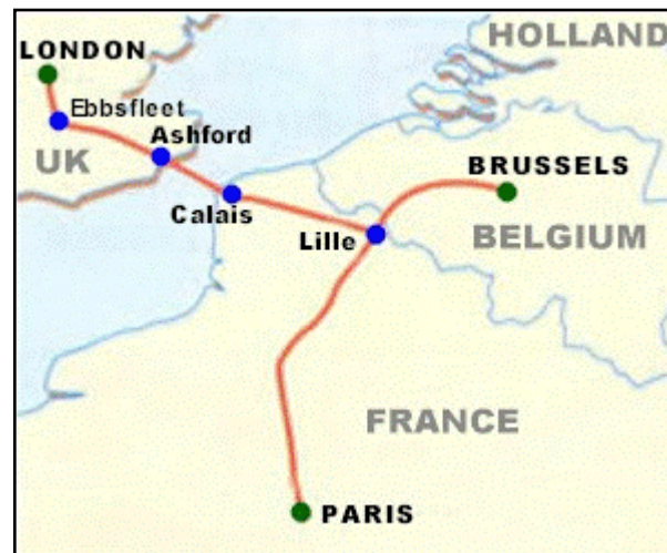
Figure 8. Eurostar Route Map

There are two primary routes in the Eurostar system: London to Brussels and London to Paris. Seasonal service is offered south of Paris to Avignon and Bourg-Saint-Maurice (Figure 8). Every Eurostar train operates out of St. Pancras Station in London, through the Channel Tunnel, to Lille in northern France. At Lille, trains head either south to Paris or other seasonal destinations or northeast to Brussels.