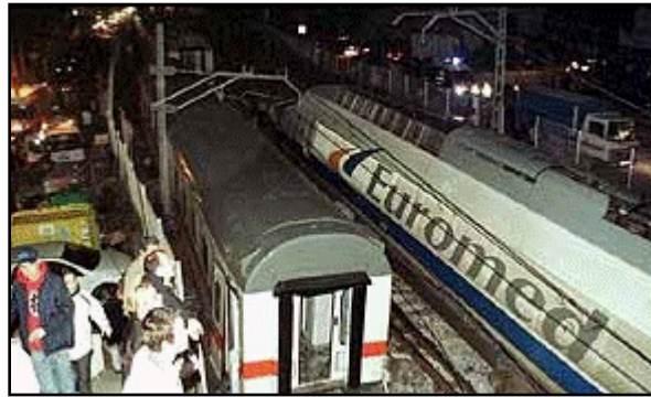
Figure 15. RENFE Collision in Torredembarra

The only significant incident on RENFE's entire HSR network occurred in March 2002 in Torredembarra, about 50 miles southeast of Barcelona. A Euromed train traveling at about 65 mph through the station to Barcelona collided with a commuter train. The commuter train had left the platform and was crossing over onto another track when it was struck by the Euromed traveling in the same direction. The commuter train was carrying approximately 350 passengers, and 290 were on the Euromed train. Two people were killed in the collision; which trains they were on is unclear. In addition, 142 people were injured, some of them seriously. Many were trapped in the wreckage, requiring extensive extrication efforts by the local emergency services. While there are no available data on how many injuries occurred on each train, eyewitness accounts referenced in several media stories stated that the majority were on the Euromed train. The aftermath of the incident is shown in Figure 15.