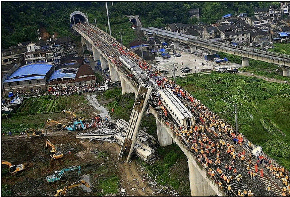
Figure 14. The Aftermath of the Wenzhou Collision

While there were many questions regarding the immediate and long-term responses of the MOR and other Chinese government agencies and officials to the incident, the most troubling issue was the fact that rescue operations were ordered to stop less than 24 hours after the collision. The cars that fell off the viaduct were broken up on-site by heavy machinery and buried prior to any investigative actions. MOR claimed that the cars were quickly scrapped and buried to keep sensitive national technology from falling into the wrong hands. Others speculated that the claims by Kawasaki and other smaller component manufacturers regarding patent theft were the driving factor.