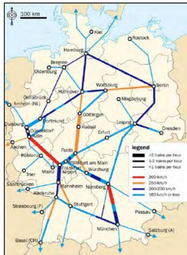
Figure 4. ICE Route Map

The West German National Railway, Deutsche Bundesbahn, began testing an experimental high-speed train developed by a Siemens Corporation–led consortium in 1984. The first InterCityExpress (ICE) service was launched in 1991 between Hamburg and Munich. Service to Bremen and Nuremburg began a year later (Figure 4). In 1994, a few years after the reunification of Germany, the assets and operations of Deutsche Bundesbahn and Deutsche Reichsbahn, the former East German national railway, were merged into Deutsche Bahn AG (DBAG). DBAG is a private, publicly traded multinational corporation divided into four separate operating entities: DB Bahn, which provides passenger rail service in Germany; DB Netze, which is responsible for the nation's rail infrastructure and operations; DB Schenker, a freight rail and logistics operation; and Arriva, which provides contract passenger rail services in the UK.