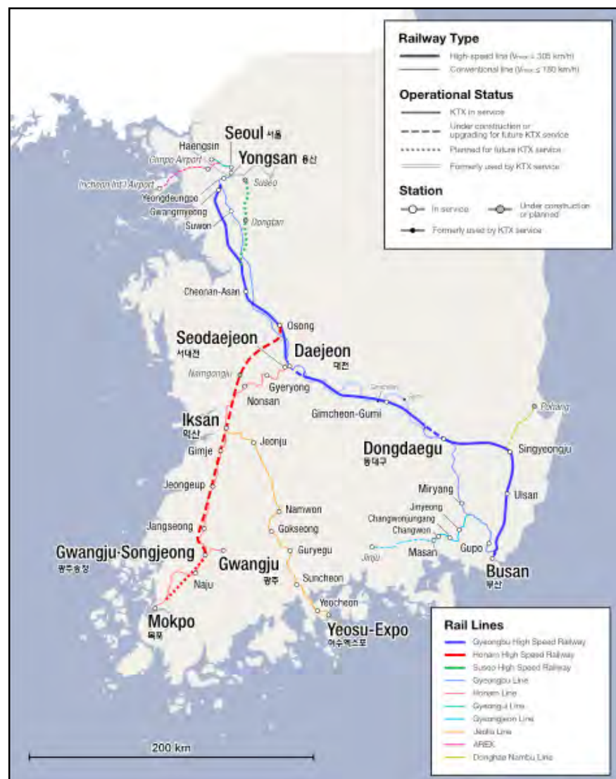
Figure 11. Korean Train eXpress Route Map

Korail, South Korea's national rail carrier for all levels of freight and passenger service, introduced Korean Train eXpress (KTX) HSR service in April 2004. The Gyeongbu line runs from Seoul to Busan, and the Honam line runs from a junction with Gyeongbu in Osong to Mokpo. Even though HSR trainsets began operating on both lines on the first day of service, the Gyeongbu line was not completed as a dedicated HSR line until November 2010 (Figure 11). Dedicated HSR expansions to the Honam line are scheduled to be completed in 2014 and 2017. Until then, KTX service will operate with HSR equipment on a combination of completed HSR lines and conventional lines.