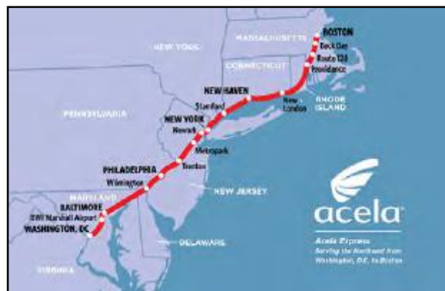
Figure 12. Amtrak Acela Route Map

Grade separations, overhead electrification, some super-elevated curves, advanced signaling systems, and the elimination of all but 11 grade crossings have brought Amtrak's Northeast Corridor (NEC) up to respectable HSR corridor standards (Figure 12). Although Acela trains, Amtrak's HSR brand, can reach speeds of 150 mph, track and catenary designs limit much of the operation to 90 to 110 mph. From New Haven south through New York to Washington, DC, the system still has the rigid suspension architecture first developed by its predecessor railroads. If this catenary system is upgraded, the Acela will be able to realize increased speeds on parts of the line, but the curvature of some track and the omnipresent commuter trains sharing the route will always be an obstacle to achieving the speeds the trainsets are capable of.