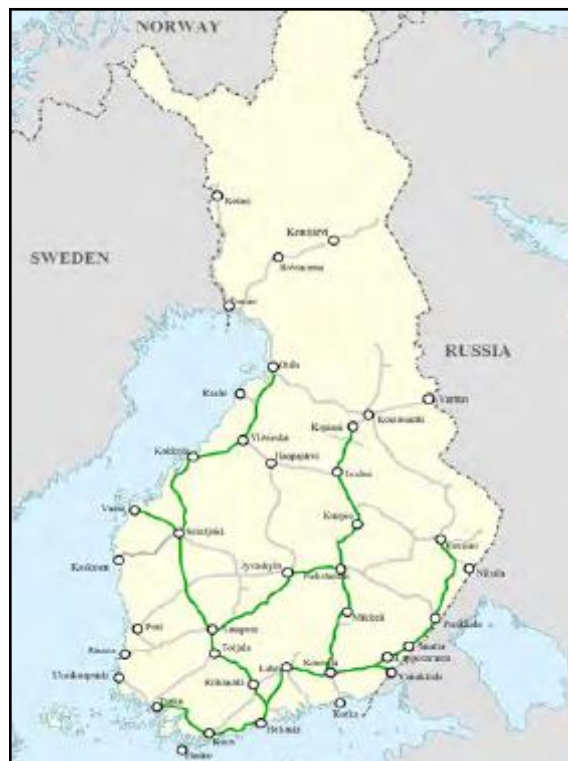
Figure 2. VR Pendolino Route Map

The state-owned VR (Figure 2) is responsible for managing the passenger and freight rail services in Finland. In 2010, the railway network infrastructure maintenance and construction functions were divested into the Finnish Transport Agency. Although the term Pendolino is a brand name of Fiat (later, Alstom) for a line or "family" of tilting trains, it is also the service brand used by the VG Group for their high-speed services. The service uses Pendolino (VR Class Sm3) trainsets built by Rautaruukki-Transtech between 2000 and 2006. The trains are capable of 140 mph service, although existing lines have limited their typical operation to less than 120 mph.