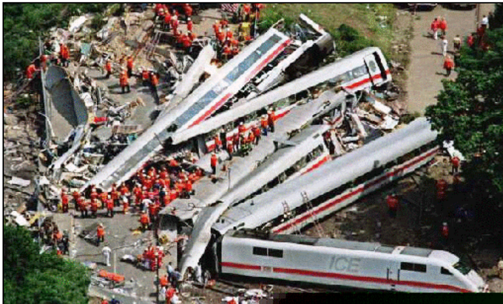
Figure 13. The Eschede Incident Scene

The fifth coach was actually severed by the collapsed bridge. The front half traveled about 300 feet past the bridge, while the rear half was crushed under the weight of the overpass. Car six was directly under the bridge at the time of the collapse and was completely flattened. Cars seven through 11 were all destroyed under or up against the remains of the bridge. The twelfth and final car of the train did not impact the bridge but was partially crushed by the rear power car, which, itself, received minimal damage. The train had a capacity of 743 passengers but was carrying only 287 at the time of the accident. The aftermath of the incident is shown in Figure 13.