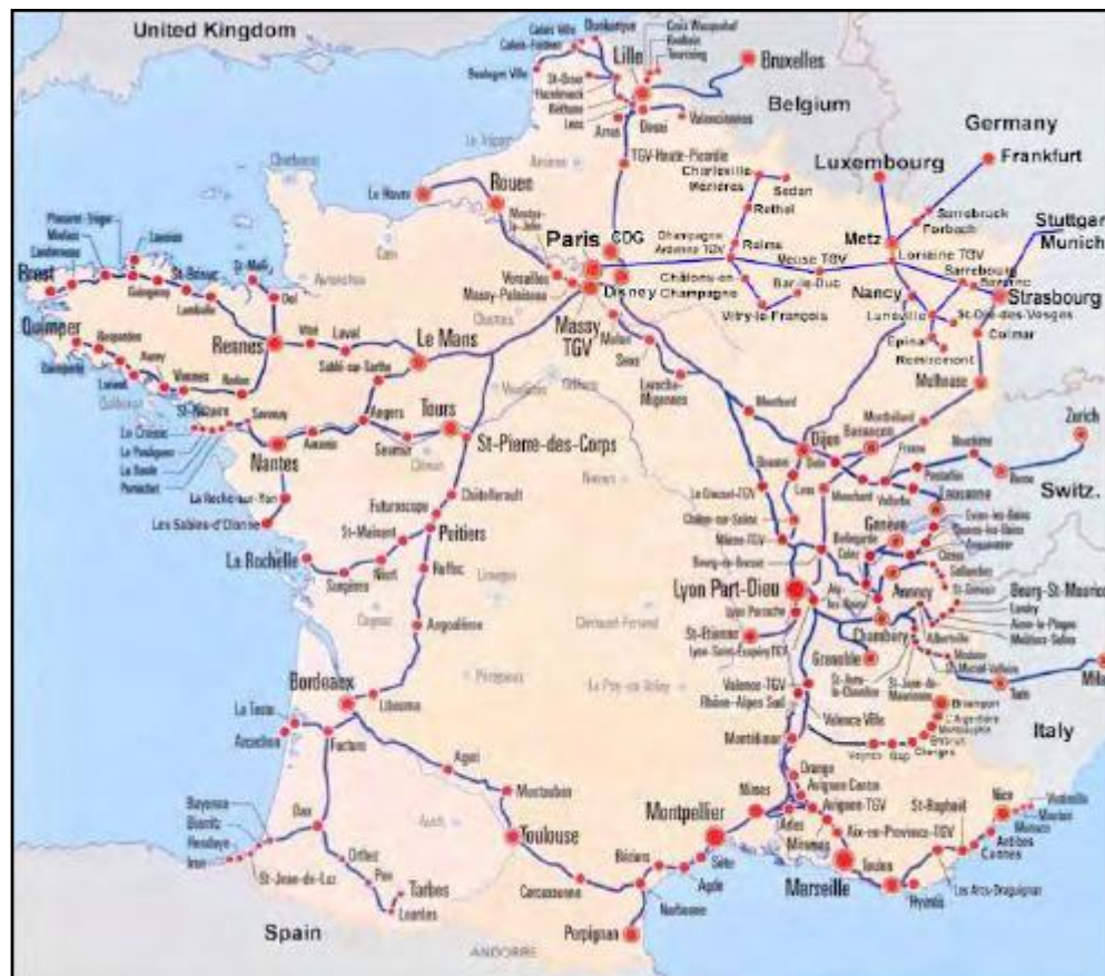
Figure 3. TGV Route Map

France's TGV (train à grande vitesse) started its HSR service between Paris and Lyon in 1981. The TGV HSR network operated by Société Nationale des Chemins de fer Français (SNCF) now consists of eight lines, all radiating from Paris, and extends into Belgium, Luxembourg, Germany, Switzerland, Spain, and Italy (Figure 3). In addition to operating the country's 20,000-mile rail network, SNCF has become a multinational powerhouse in railroad consulting, construction, and operation. In 1997, an EU directive forced SNCF to divest ownership of the rail infrastructure to a separate, government-owned entity, Réseau Ferré de France. SNCF and its partner Alstom have successfully exported the TGV technology to HSR operations in Spain, Taiwan, South Korea, and Belgium.