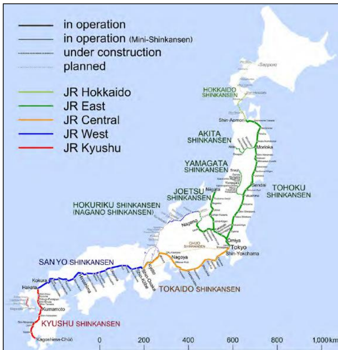
Figure 10. Shinkansen Route Map

Today, the Shinkansen network includes more than 1,600 route miles (Figure 10) and operates approximately 900 trains per day at speeds between 150 and 190 mph. It is owned and operated by five private companies of the JR Group: JR Kyushu, JR West, JR Central, JR Hokkaido, and the largest, by far, in terms of system size and passenger volume, JR East. These companies utilize 20 different styles and configurations of overhead electrically powered trainsets with power cars at each end. Capacities per trainset range from approximately 380 passengers on six- and seven-car sets to 1,200 passengers on 12-car bilevel trainsets and more than 1,300 on 16-car sets.