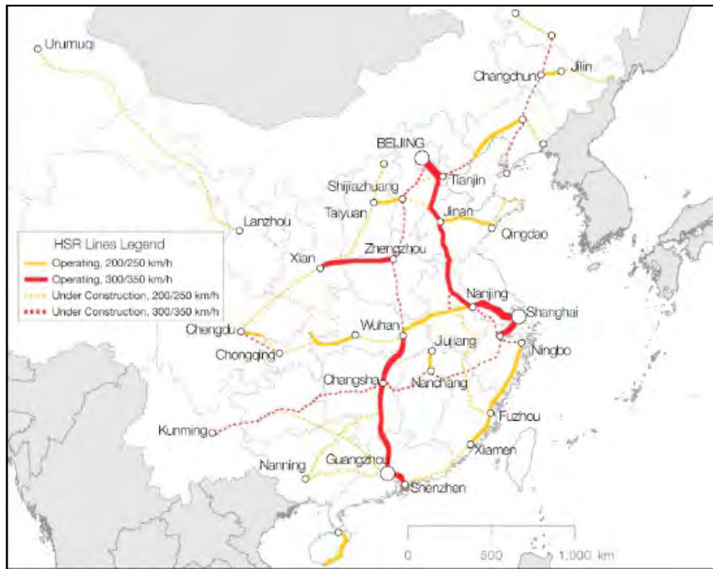
Figure 9. Chinese High-Speed Railway Route Map

Although the Chinese Ministry of Railways (MOR) did not begin construction of its first HSR line until 1998, China is now home to the world's largest HSR network. The first line, from Beijing to Tianjin, opened a week before the 2008 Olympics; a little more than four years later, the country had 5,809 miles of high-speed lines with trains traveling 186 mph (Figure 9). The network includes eight primary routes: four north/south lines and four running east and west, concentrating service in the population centers in the eastern portion of the country.