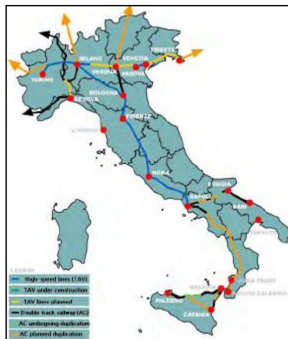
Figure 5. Trenitalia Route Map