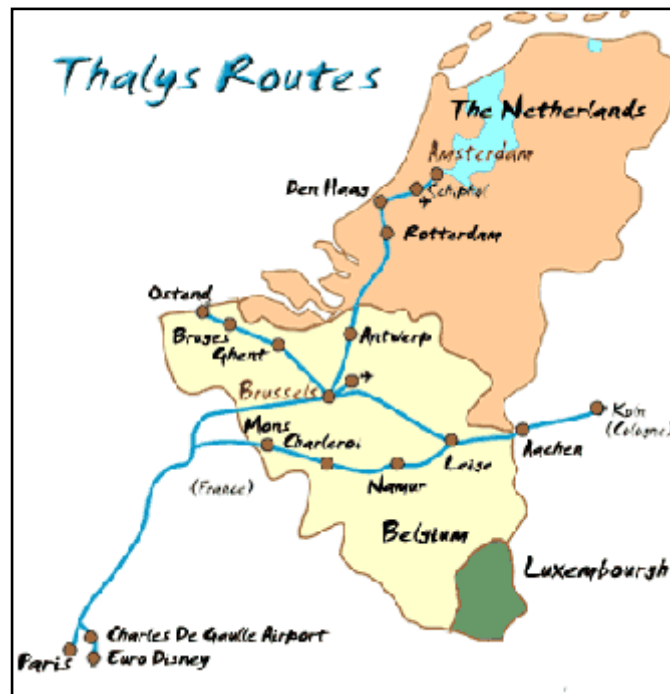
Figure 1. Thalys Route Map

Thalys is a joint service offered by the Belgian, French, and Dutch railways. The system is centered in Brussels, with three primary lines radiating outward (Figure 1). Two of the lines, one to Paris and one to Amsterdam, are also shared by the Eurostar service, and the third extends into Cologne, Germany. A fourth line extends northwest from Brussels to the city of Ostend, on the North Sea. A separate line leaves the Paris-Brussels line near the France-Belgium border, traveling through the cities of Mons, Charleroi, and Namur before joining the Brussels-Cologne line in Liege, essentially providing a southern bypass around Brussels. Service extensions now also include routes to Dusseldorf and Essen from Cologne and a line to Avignon and Marseille, south of Paris. Trains between Paris and Brussels, Brussels and Aachen, and Antwerp and Amsterdam use a variety of dedicated HSR lines. The remaining service runs primarily on conventional tracks.