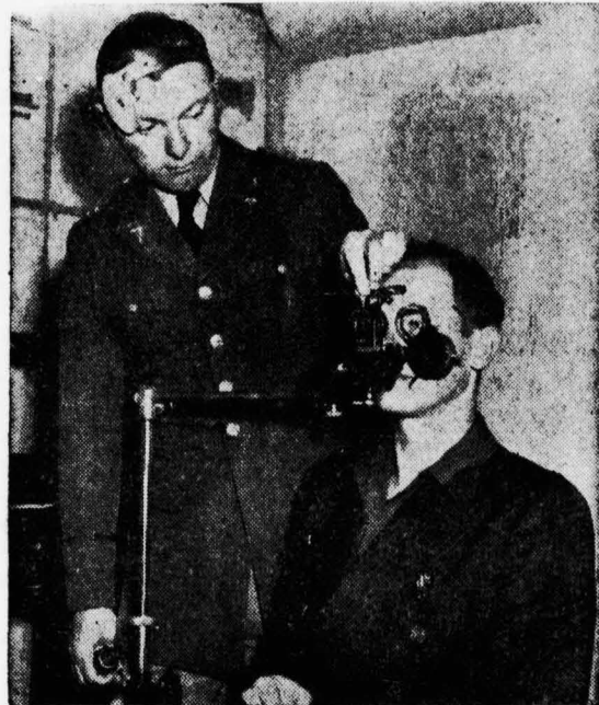
Undergoing the eye test under the scrutiny of a doctor of the medical air corps is part of the examination. The young man pictured is headed for a flying career which will lead him to final training at Kelly field, Texas.

With the balance of the senior class away on the sneak, the battle quieted down last night, and