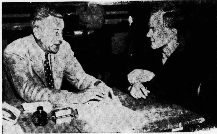
Pictured above is a scene familiar to San Jose State students who have appeared before the 9th Corps Area flying examination board for entrance to the United States army air corps reserve.