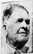
POP WARNER Advisory Coach