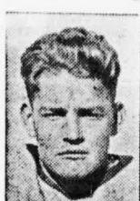
COOK Left Guard