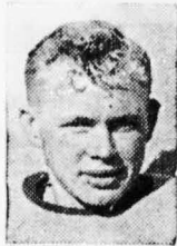
TORNELL Right Tackle