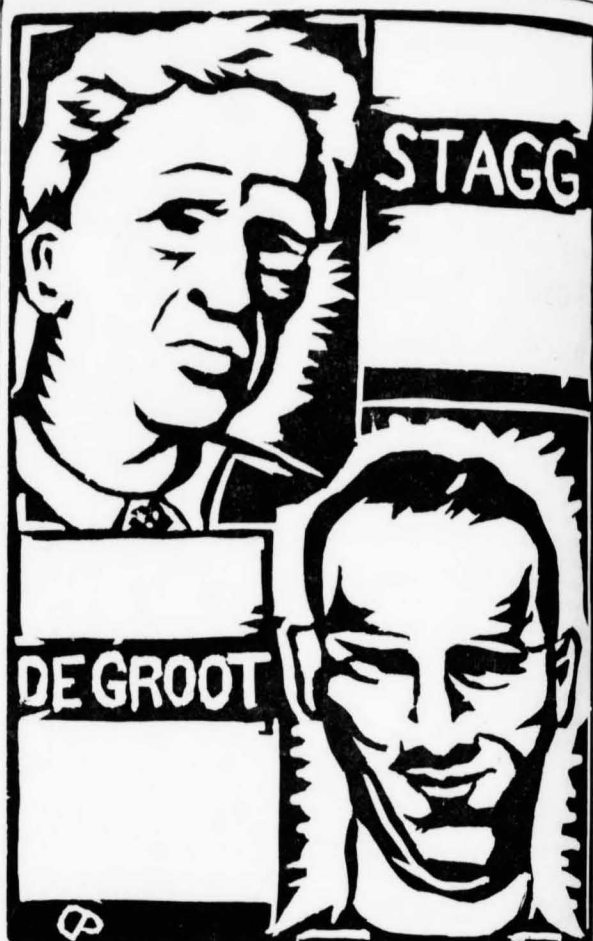
Coaches Amos Alonzo Stagg and Dud DeGroot renew their rivalry Friday night at Stockton when their College of Pacific and San Jose State elevens meet in the little "Big Game". Since coming to C.O.P. in 1933, Stagg has failed to win a victory over DeGroot's Spartans. The nearest he came was in 1935 when the teams played a 0-0 tie.

Ski club group picture for La Torre today at 12 noon. Members will meet on North steps of Art building.