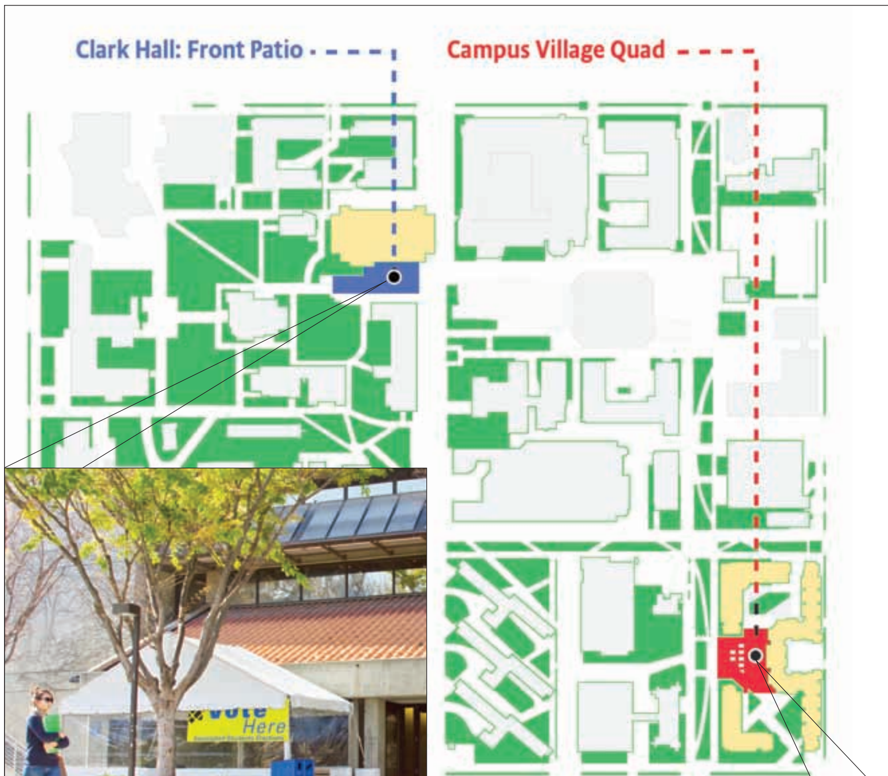
Illustration: Leo Postovoit / Spartan Daily