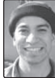
Sophomore Mechanical Engineering

If I were more informed about what it is exactly — about what A.S. voting is, and what it's for and what it would do for me, exactly, as a student. If it were more presented to every student as to what it is, in their classrooms maybe. If their teacher told them "Hey, this is what elections is for. Here's how it can help you." That kind of thing.