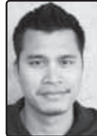
Senior Management Information Systems

If I know what changes the new president is going to bring to the school. I really don't know that much about it, probably because there's not a lot of publicity and that can be one of the reasons for other people as well. I didn't even know there was an election going on.