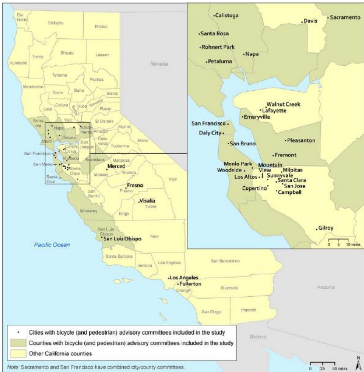
Figure 1. Map of the 42 Committees Included in the Study

In addition, efforts to recruit women were reviewed, and the committee bylaws and other official documents were examined for language about gender and/or the need for diversity.