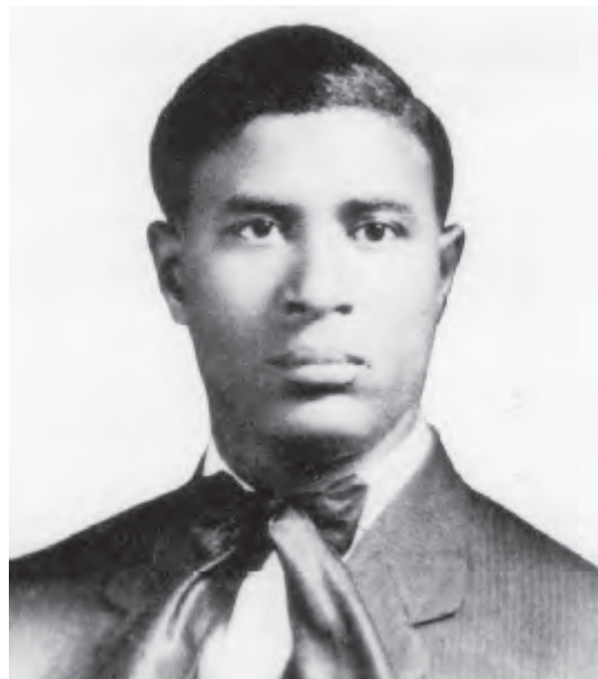
Figure 1. Garrett Augustus Morgan as a Young Man

Garrett Augustus Morgan, for whom the U.S. Department of Transportation Technology and Transportation Futures Program is named, was born in Paris, Kentucky, in 1877. The seventh of 11 children, his parents were former slaves. Although his formal education ended at the sixth grade, Garrett Morgan went on to become a world-famous inventor and entrepreneur.