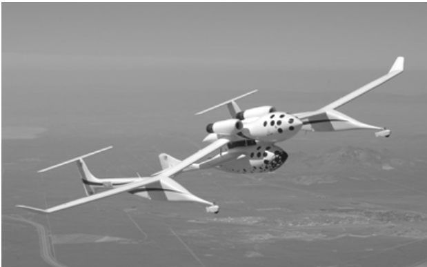
Figure 5: The White Knight turbojet aircraft with Space Ship One attached to its underbelly. On 4 October 2004, it won the $10 million Ansari X Prize. The competition challenged independent designers to safely put three people into space twice in two weeks with a reusable spacecraft [24].

Aerospace propulsion is also a senior-level course, usually taken in the same semester as AE164. It is a