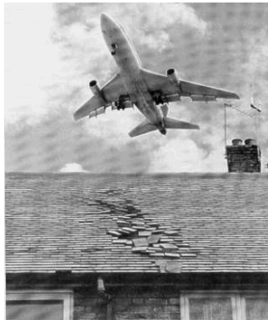
Figure 4: Roof damage from airplane tip vortices [21].

in departures and arrivals. In addition, buildings near busy airports suffer property damage from these vortices (see Figure 4). In the Heathrow Airport area, houses had their roofs damaged by wake vortices, forcing local authorities to spend 5 million pounds to reinforce 2,500 roofs.