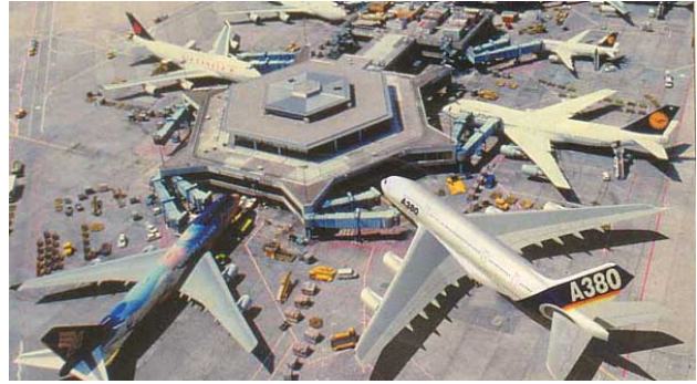
Figure 7: An Airbus 380 (mock-up) at a docking gate. Note the relative size of the Boeing 747s on either side [28].