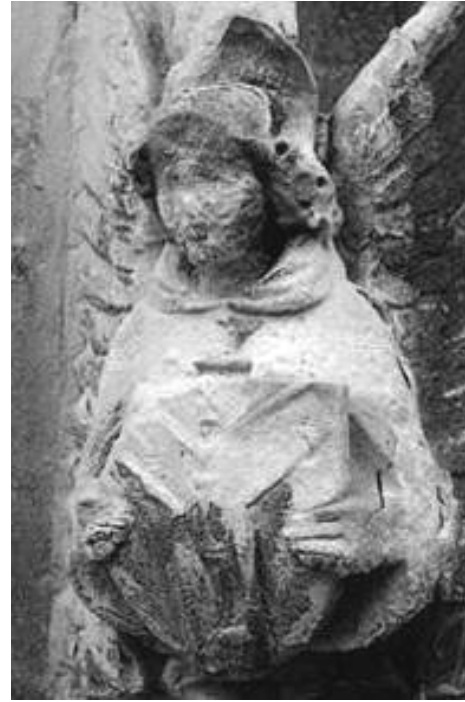
Figure 2: A popular photograph showing the effects of acid rain on a statue (original source unknown) [15].

In Spring 2003, the range of topics chosen for the research project discussed earlier included the following: