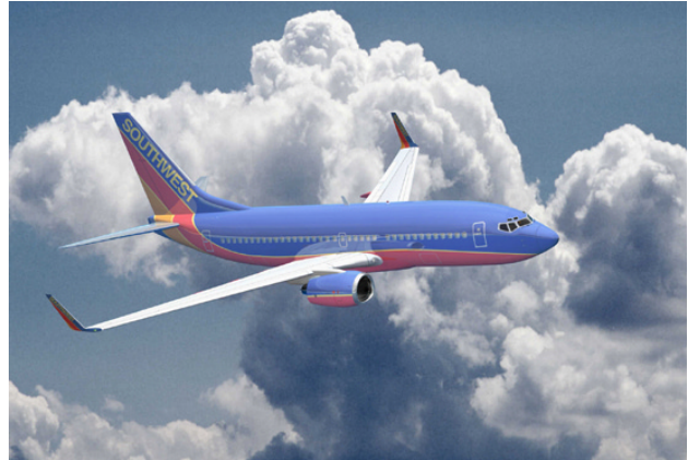
Figure 3: A Boeing 737-700 jet showing the winglets, which provide increased range and improved climb performance [20].

in departures and arrivals. In addition, buildings near busy airports suffer property damage from these vortices (see Figure 4). In the Heathrow Airport area, houses had their roofs damaged by wake vortices, forcing local authorities to spend 5 million pounds to reinforce 2,500 roofs.