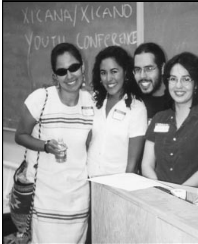
Participants at the NACCS San Antonio Conference.