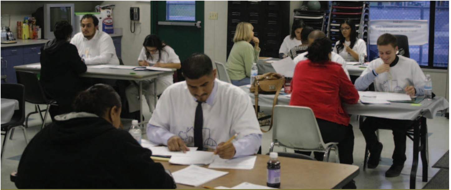
Wearing CommUniverCity T-shirts, students interviewed 26 clients at the McKinley Neighborhood Center Speed Screening