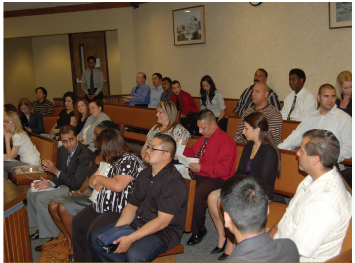
With over 250 SJSU students involved in filing 221 petitions on behalf of clients, the Record Clearance Project has affected the lives of many people in positive ways