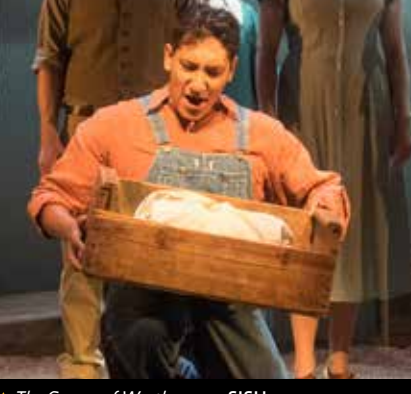
▲ The Grapes of Wrath opera, SJSU

As a Dean, it is vitally important to have discretionary funds that provide seed money to encourage development and execution of such important and impactful collaborations. I am grateful to those who contributed to the DEAN'S LEADERSHIP CIRCLE in the past two years.