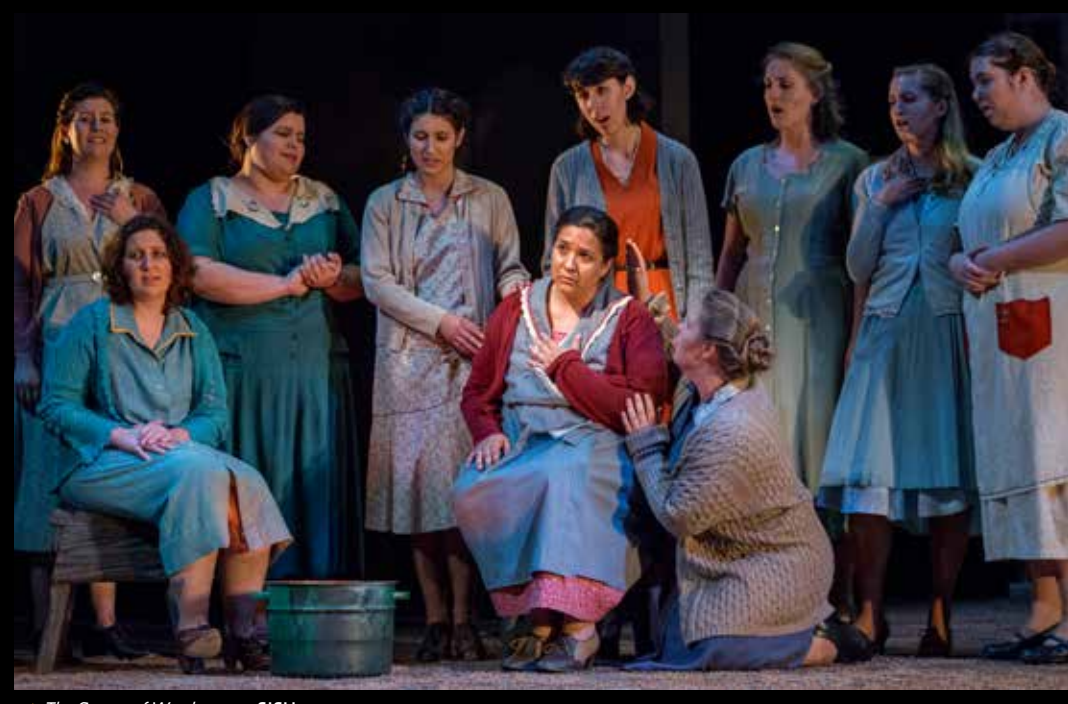
▲ The Grapes of Wrath opera, SJSU