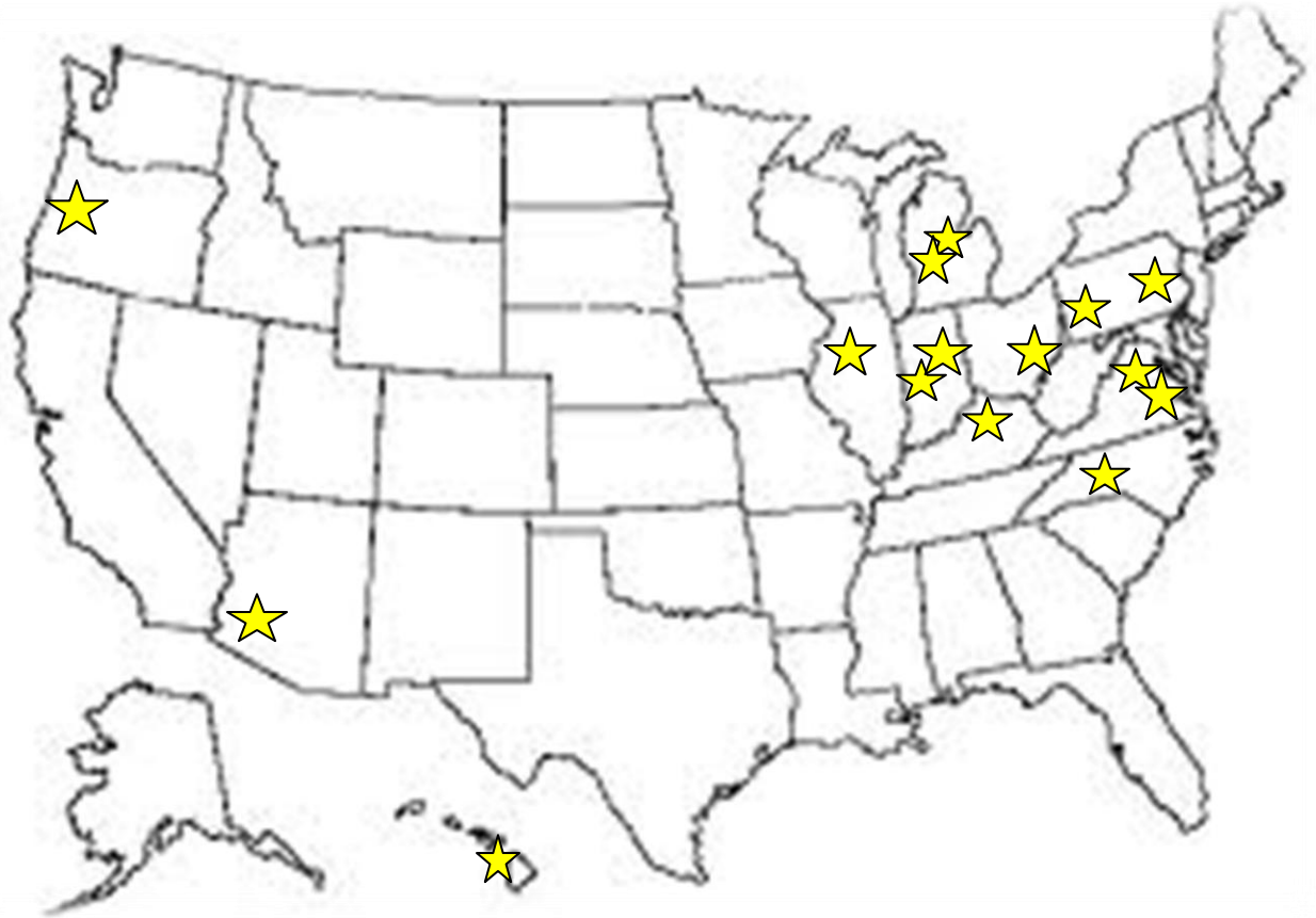
Figure 1. National Distribution of Post-Professional Athletic Training Education Programs

wrong with pursuing an advanced degree in another area if it meets that individual's professional needs.