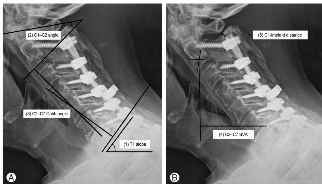
Fig. 2. (A) Radiological parameters. (1) T1 slope angle: the angle between a horizontal line and the upper end plate of T1. (2) C1–C2 lordosis angle: the angle of intersection between a line connecting the anterior tubercle to the posterior margin of the C1 spinous process and a line parallel to the inferior end plate of C2. (3) C2–7 Cobb angle. (B) Radiological parameters. (4) C2–7 sagittal vertical axis (SVA): the distance between the plumb line dropped from the center of C2 and the posterior superior corner of C7. (5) C1–implant distance: the distance from the most proximal implant to C1 arch on neutral lateral cervical X-ray.