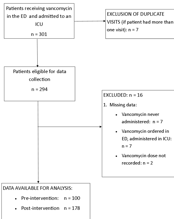
Figure 2. Pre- and post-intervention vancomycin administration and eligible patients for analysis flow diagram. ICU, intensive care unit

of patients received an appropriate dose (Table 2). The proportion of patients receiving a dose of 1g decreased (84% vs. 52%, p<0.001 ). Vancomycin trough levels were obtained in 157 patients (56%), and median trough levels did not change during the study period (13.3, IQR [10.6-22.4]) vs. 13.8, IQR [9.4-18.3], p=0.59 )