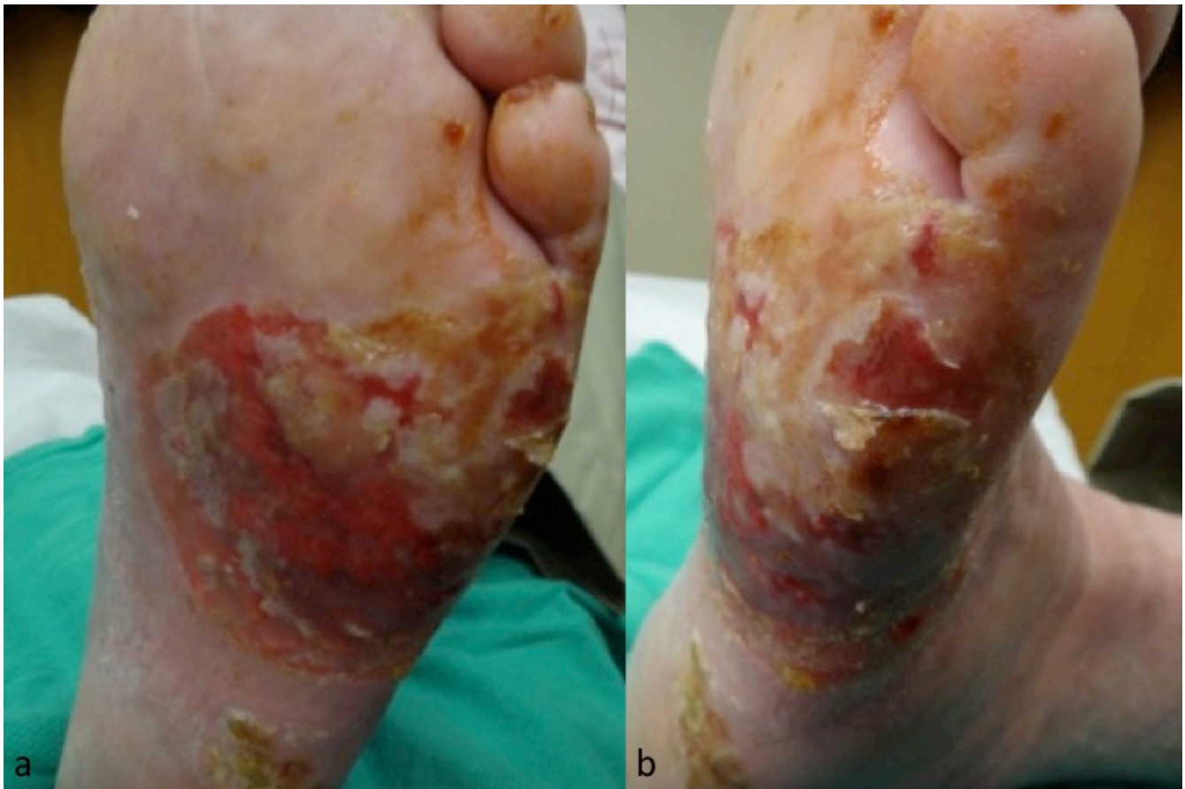
Figure 1 Parts A-B. Plantar and lateral surface views of the left foot showing the erythematous ulcerated plaque at the time of biopsy

developed an open ulceration (Figure 1a, b): Plantar surface. Figure 1b: Lateral surface) on the left plantar surface and biopsies were performed.