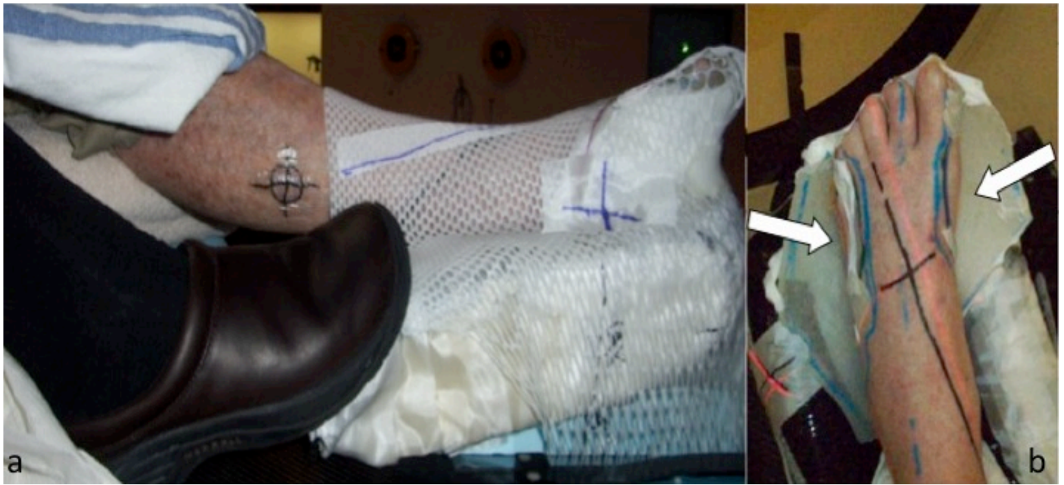
Figure 3 Parts a-b. The thermoplastic mesh boot surrounding a 1 cm tissue-equivalent custom bolus (arrows). The tissue-equivalent acts to absorb photons and protect normal tissue outside of the therapeutic field.

completion of his intensity modulated radiation therapy regimen (Figure 4a). Clearing was achieved and maintained at two and five months after completing treatment (Figures 4b-d).