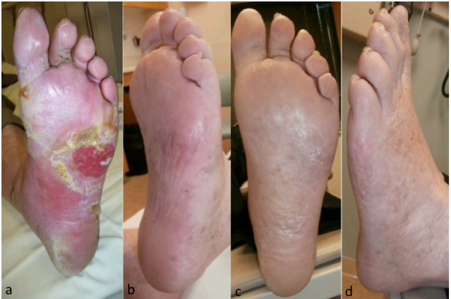
Figure 4 Parts a-d. Post-treatment clinical response at 0 months (a), 2 months (b), and 5 months (c and d)