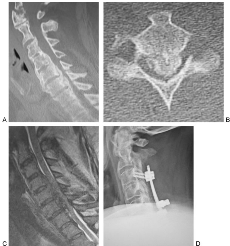
Fig. 2 Case 6. Sagittal (A) and axial (B) computed tomography shows diffuse idiopathic spinal hyperostosis (C2–C5, C7–T2) and mixed-type ossification of the posterior longitudinal ligament (C1–C2, C4–C7). Sagittal image on T2-weighted magnetic resonance imaging (C) shows severe cord compression. Postoperative plain lateral radiograph (D) shows postoperative posterior spinal instrumentation and fusion (C3–C7) with laminectomy (C2–C7).