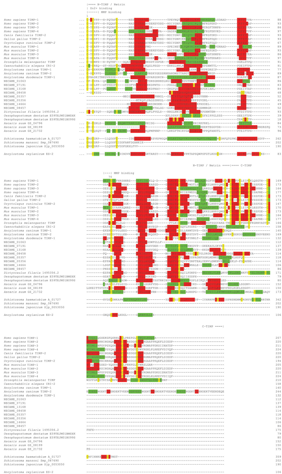
Figure 1 (See legend on next page.)