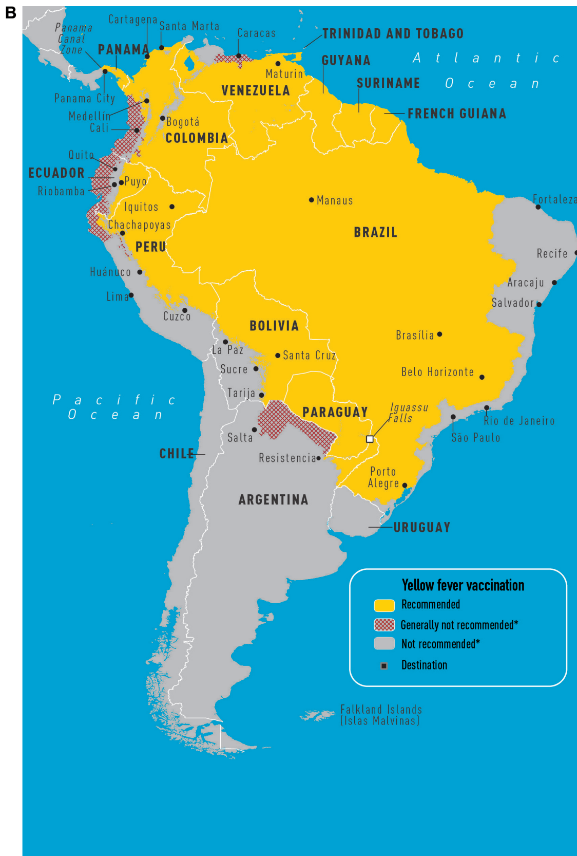
Figure 1 CDC maps of regions of Africa (A) and South America (B) at risk for yellow fever transmission. 49

Notes: Yellow-shaded regions represent areas where vaccination is recommended, while gray areas have minimal risk of yellow fever transmission. *Not recommended unless individual practice patterns suggest higher risk. The CDC plans to publish updated maps in 2015, and the most current recommendations can be found online at www.cdc.gov . Copyright © 2014. Adapted from Gershman MD, Staples JE. Infectious Diseases Related to Travel: Yellow Fever . Chapter 3: Yellow Book; 2014. Available from: http://wwwnc.cdc.gov/travel/yellowbook/2014/chapter-3-infectious-diseases-related-to-travel/yellow-fever . 49