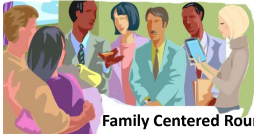
Family Centered Rounds