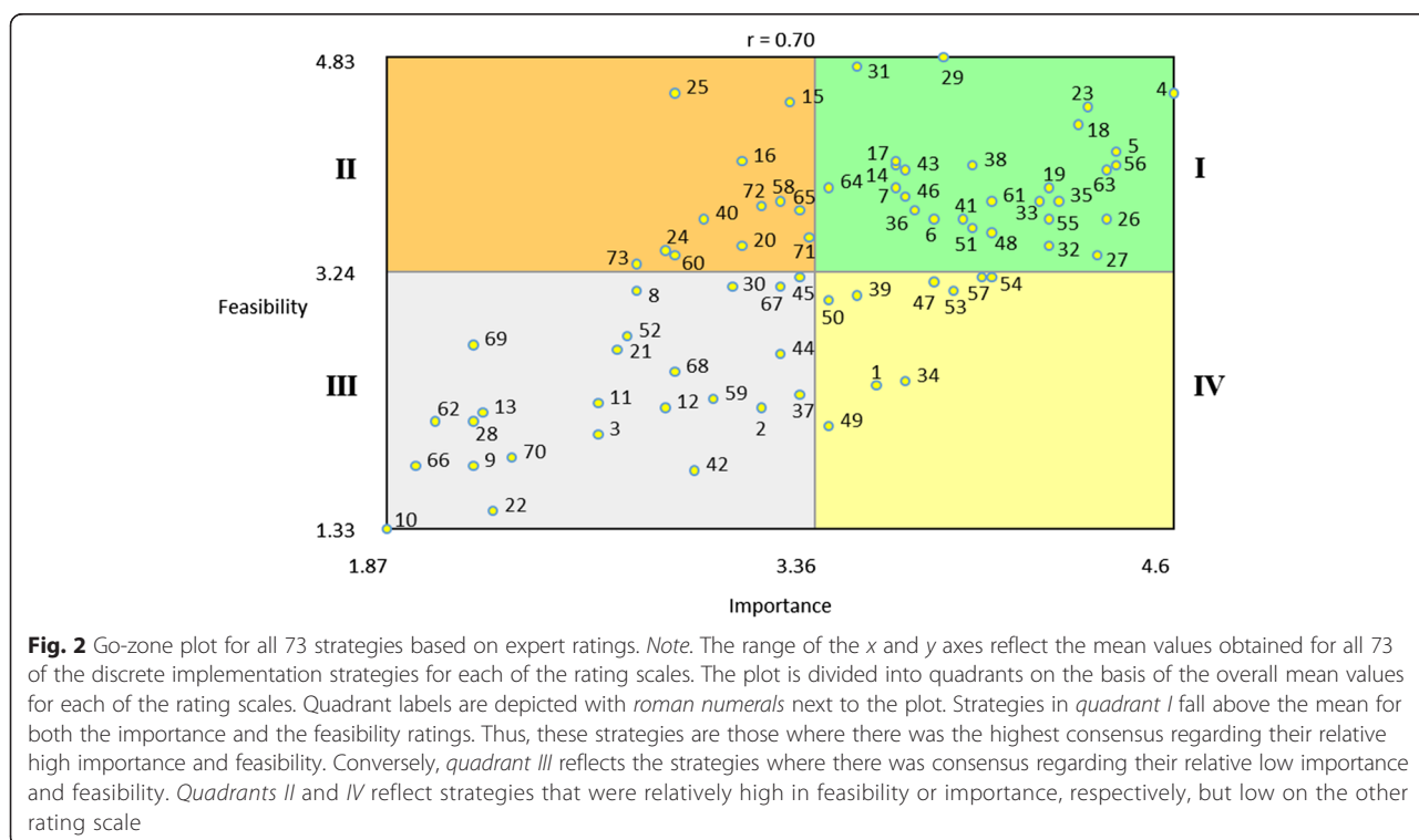
Fig. 2 Go-zone plot for all 73 strategies based on expert ratings. Note. The range of the x and y axes reflect the mean values obtained for all 73 of the discrete implementation strategies for each of the rating scales. The plot is divided into quadrants on the basis of the overall mean values for both the importance and the feasibility ratings. Thus, these strategies are those where there was the highest consensus regarding their relative high importance and feasibility. Conversely, quadrant III reflects the strategies where there was consensus regarding their relative low importance and feasibility. Quadrants II and IV reflect strategies that were relatively high in feasibility or importance, respectively, but low on the other rating scale

Results from this study provide initial validation for viewing the 73 implementation strategies as conceptually distinct. Cluster analyses of the concept mapping data support grouping strategies into nine clusters which