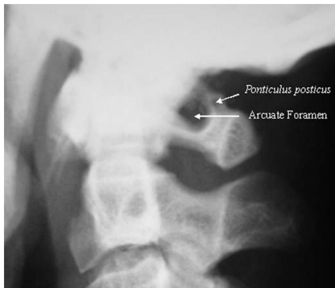
Fig. 1 Lateral radiograph of the cervical spine, demonstrating an arcuate foramen of the first cervical vertebra and a ponticulus posticus.

In addition, twenty other preserved cadavers, selected at random, were dissected. A separate group of six cervical spine osseous specimens that had previously been dissected out were also examined. The anatomical characteristics of the specimens were studied, and the specimens were photographed.