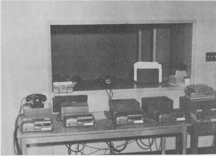
Shown at the left are the centralized recorders located in the Medical Record Department, which were mentioned in the preceding article.