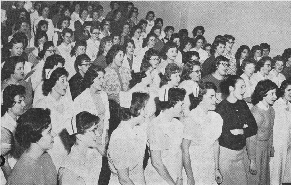
Rehearsing carols for the fourth annual Christmas pageant are members of the 150-voice Nurses Choir. In addition to appearing on the program in Barnes Lobby on December 19, the student nurses were heard via taped recordings on radio stations KFUE and KSTL-FM.