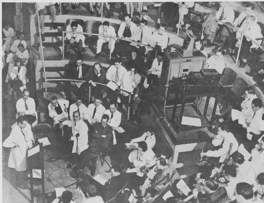
Above is the medical amphitheatre on the third floor of Barnes which was used for lectures, conferences, and presentation of patients before the visiting and house staffs and students. Below is the amphitheatre during the wrecking process which is being done in preparation for expansion of service facilities.