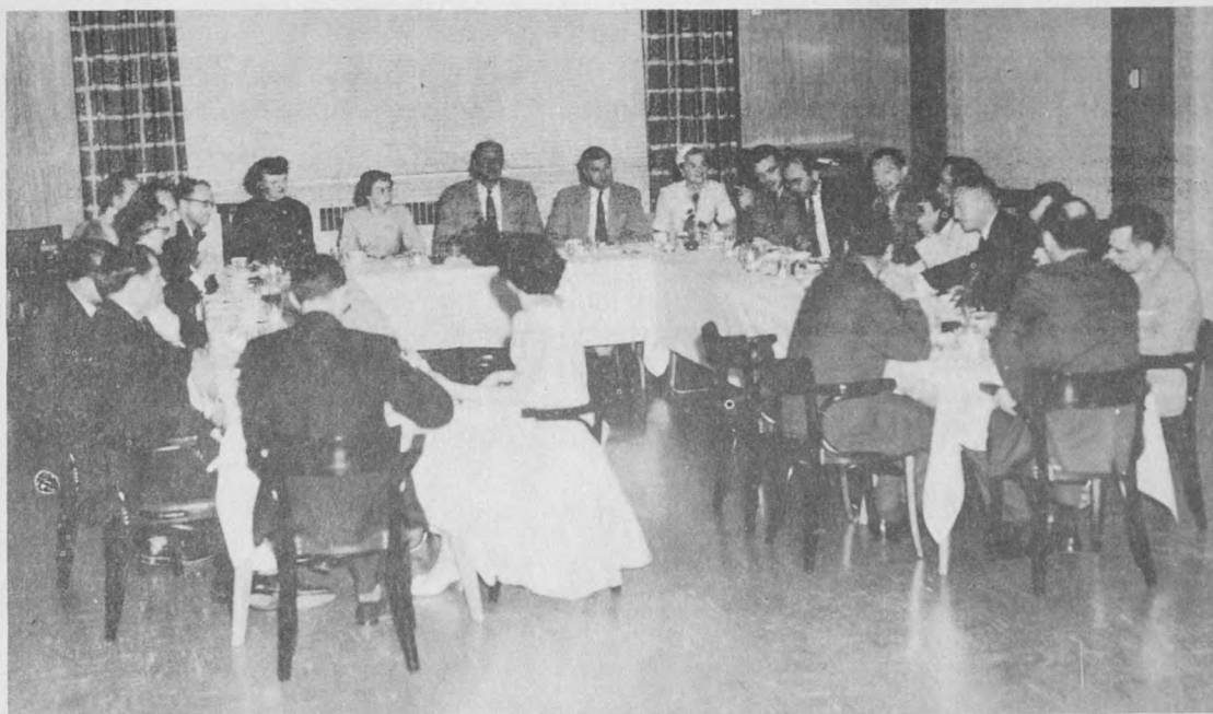
Shown above, the Hospital Administration Class of 1955, has breakfast in Wohl Dining Room before going to the campus to receive their degrees at the commencement ceremonies on June 8.

BARNES HOSPITAL 600 South Kingshighway St. Louis 10, Missouri