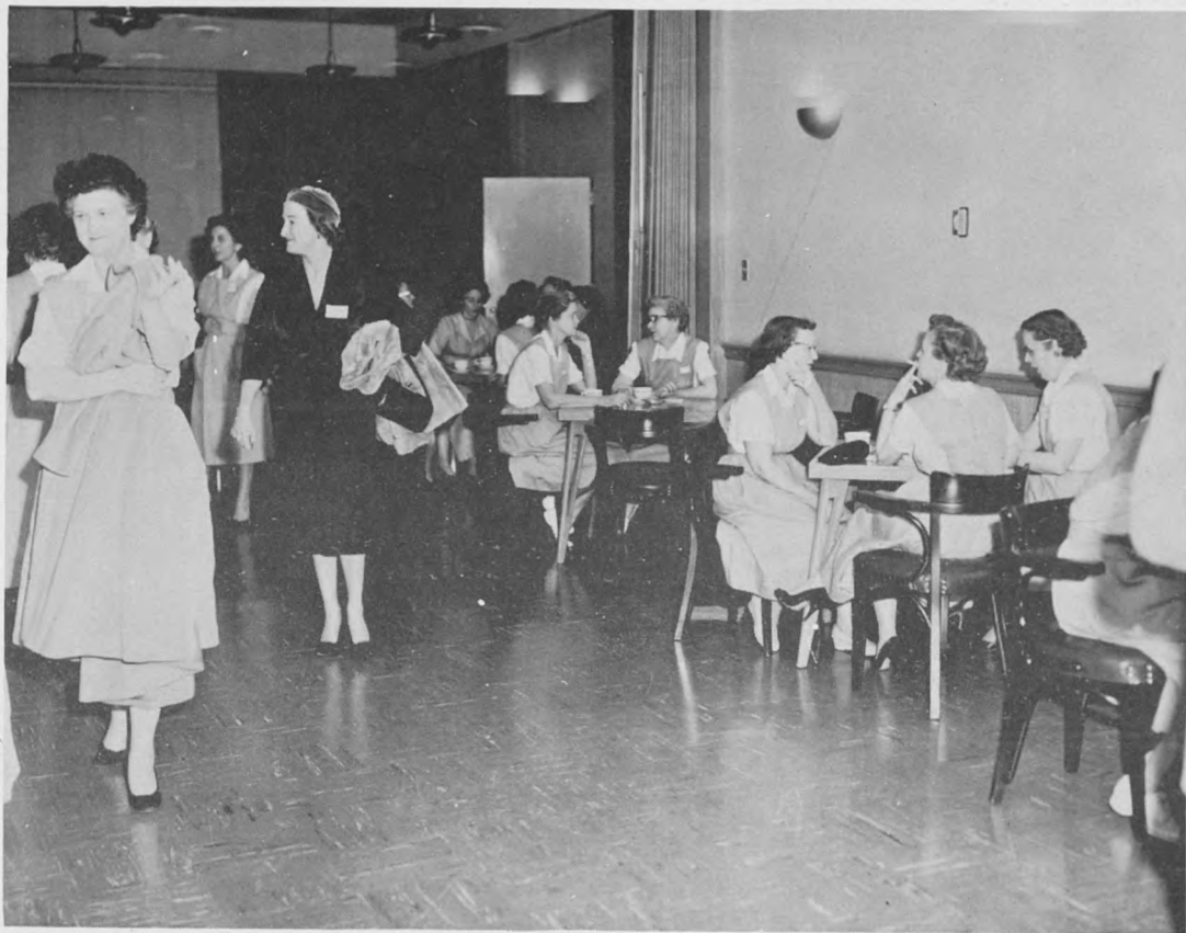
Volunteers in the Women's Auxiliary of the Washington University Clinics enjoy a tea given in their honor on November 6 in the Wohl Dining Room. The event was sponsored by Clinics administration as a token of esteem and appreciation for the many hours of helpful service provided by the ladies through the Women's Auxiliary.