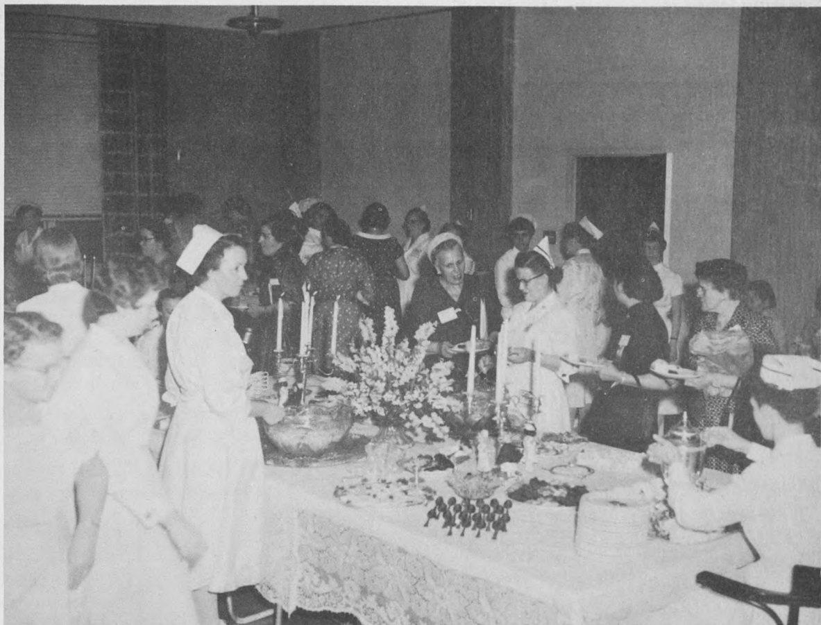
Shown above are some of the visitors from the National League for Nursing who accepted an invitation to a tea and a tour of Barnes Medical Center on May 4. The National League for Nursing Convention was held in St. Louis May 2-6.

"Gee", lamented the cannibal chief, "I wish a few shipwrecked sailors would wash ashore. What I need is a good dose of salts".