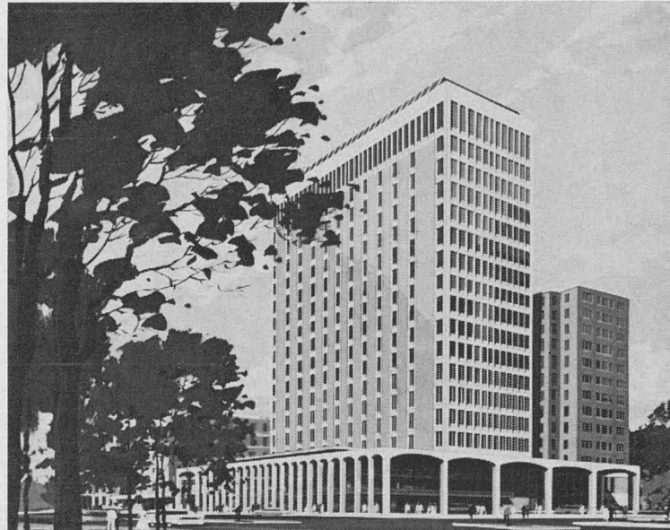
The $6 million, 17-story Tower Building on the site of the present Private Pavilion is expected to attract patients from all over the nation when it is completed sometime in 1965.

Any employe knowing of such facilities should contact the Volunteer Office. Your help will be appreciated.