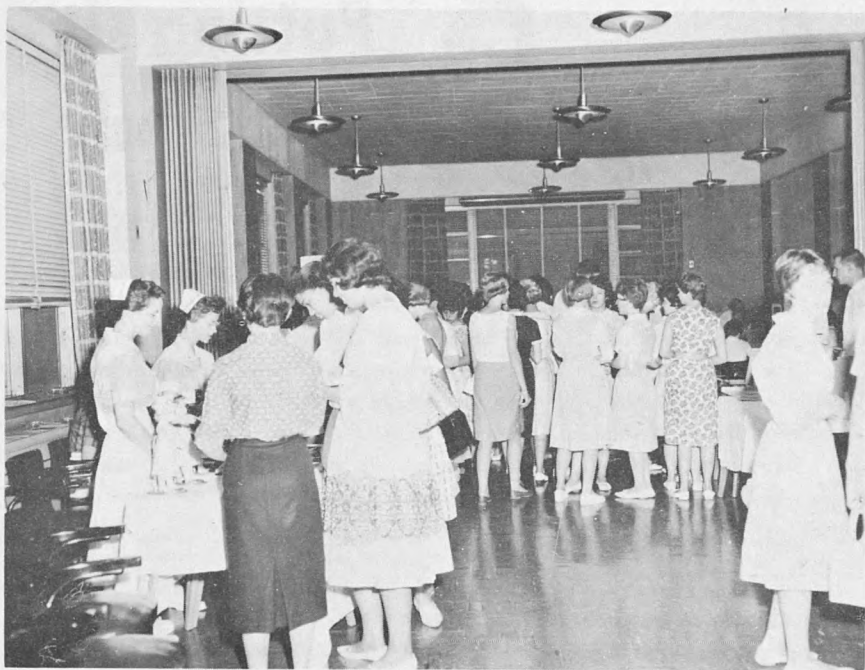
CANDY STRIPERS ORIENTATION HELD IN WOHL DINING ROOM