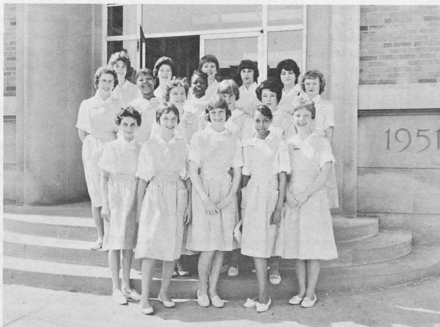
NEW CANDY STRIPERS