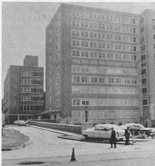
David P. Wohl Jr. Memorial—Washington University Clinic Building as seen from Audubon Avenue.