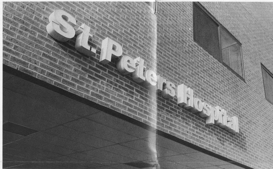
St. Peters Hospital, a 119-bed facility in St. Charles County, was purchased by Barnes Hospital in late January as part of a strategic plan that calls for broader coverage of services to local and regional healthcare markets. In addition to the hospital, two medical office buildings are included on the 21-acre site. St. Peters employs approximately 400 staff members and has an active volunteer program of about 90 junior and adult volunteers. The medical staff consists of more than 200 doctors, representing 30 medical and surgical specialties.