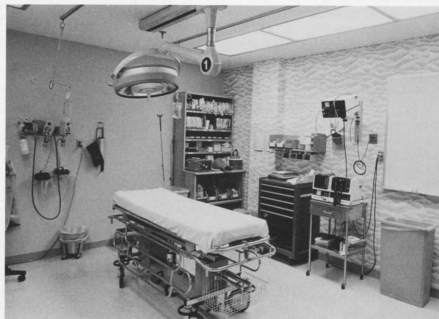
The trauma room of the emergency department is decorated in soothing earth tones. Another room for children's emergencies sports race cars and trucks.