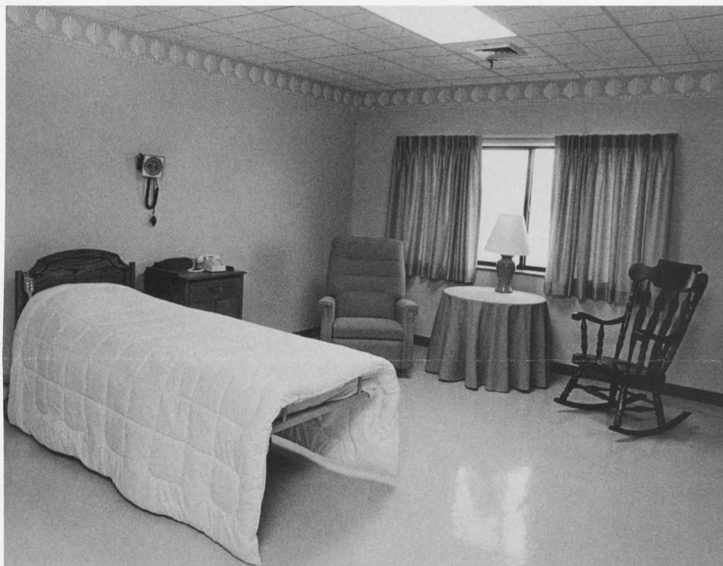
"Suite beginnings," a unique family-centered maternity service that allows for labor, delivery, recovery and postpartum care all to take place in the privacy and comfort of the same room, opened in December at St. Peters.