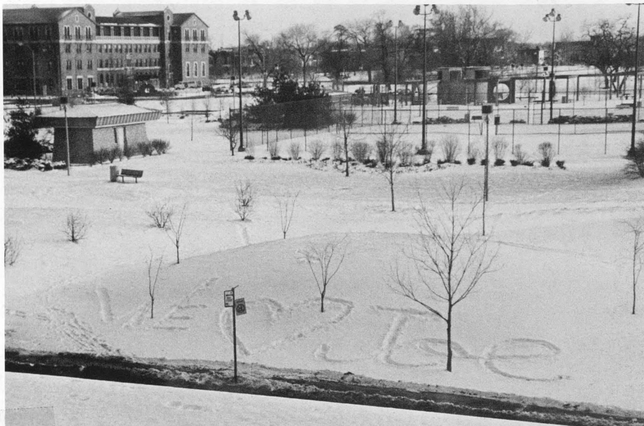
Sentiments in snow: The snowfall just before St. Valentine's Day provided the perfect medium for a giant love letter. The message, just across Barnes Hospital Plaza, was visible from the upper floors of Barnes' East/West Pavilion.