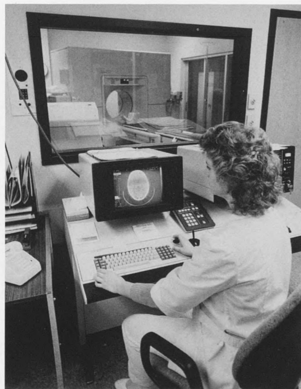
Radiology houses a computerized axial tomography (CAT) scan, used for diagnostic testing. The scan attains a series of detailed visualizations of tissue at any depth.