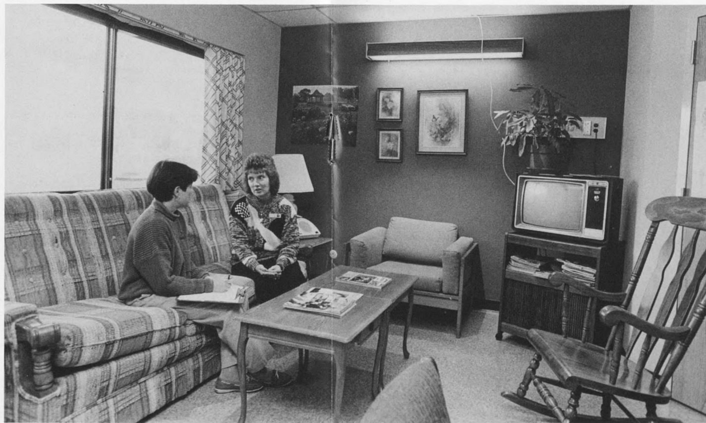
The comfortable day room of the St. Peters stress unit is open to patients as a recreation area. Staff also use the room to conduct patient evaluations (above). The New Horizons program, for alcohol- and drug-dependent persons, is part of the stress unit.