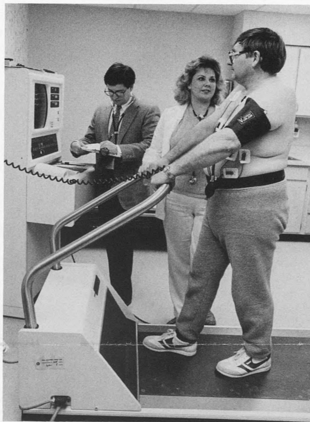
A St. Peters physician and technician guide a patient through a stress test in the cardiopulmonary department.