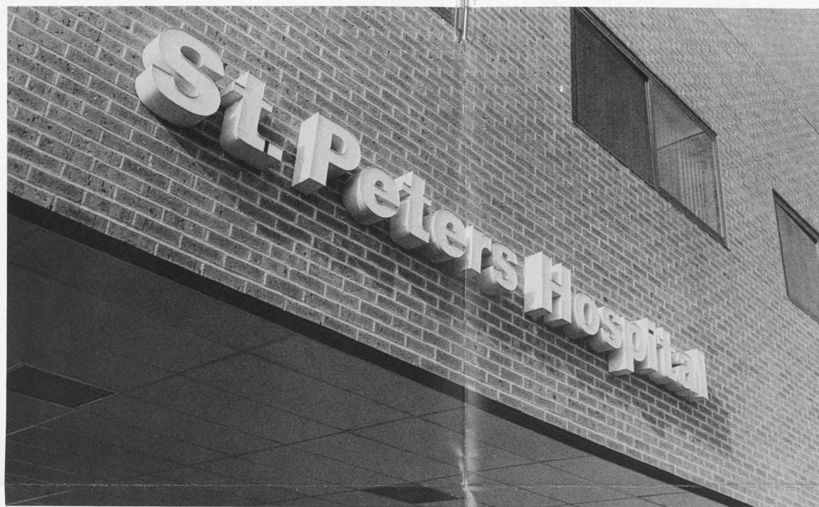
St. Peters Hospital, a 119-bed facility in St. Charles County, was purchased by Barnes Hospital in late January as part of a strategic plan that calls for broader coverage of services to local and regional healthcare markets. In addition to the hospital, two medical office buildings are included on the 21-acre site. St. Peters employs approximately 400 staff members and has an active volunteer program of about 90 junior and adult volunteers. The medical staff consists of more than 200 doctors, representing 30 medical and surgical specialties.