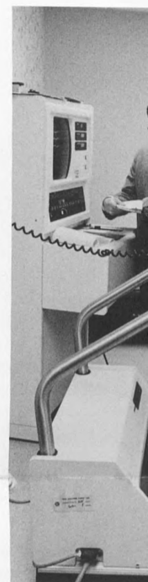
A St. Peters physician uses a stress testing machine.