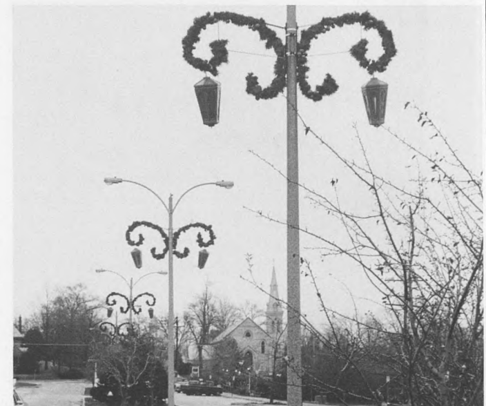
Those who drive through downtown Kirkwood may enjoy the community's holiday spirit, marked by brightly decorated streetposts, shops and public buildings.