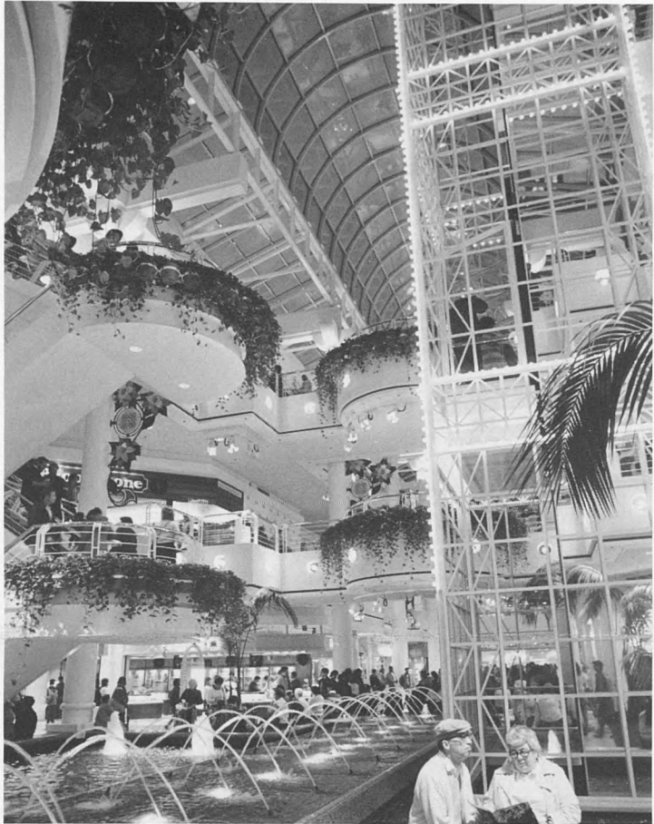
St. Louis Centre, acclaimed as the largest enclosed urban shopping mall in the country, provides a spectacular holiday display along with more than 110 shops. St. Louis Centre, the dream of a group of local business developers, is located between Washington, Locust, 6th and 7th streets downtown.