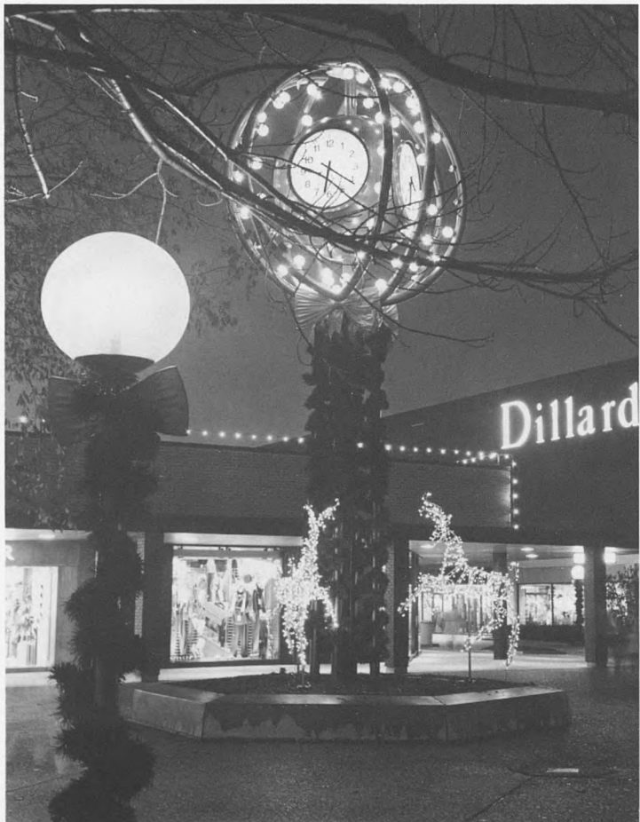
Delicate reindeer frolic amid twinkling lights at Northwest Plaza.