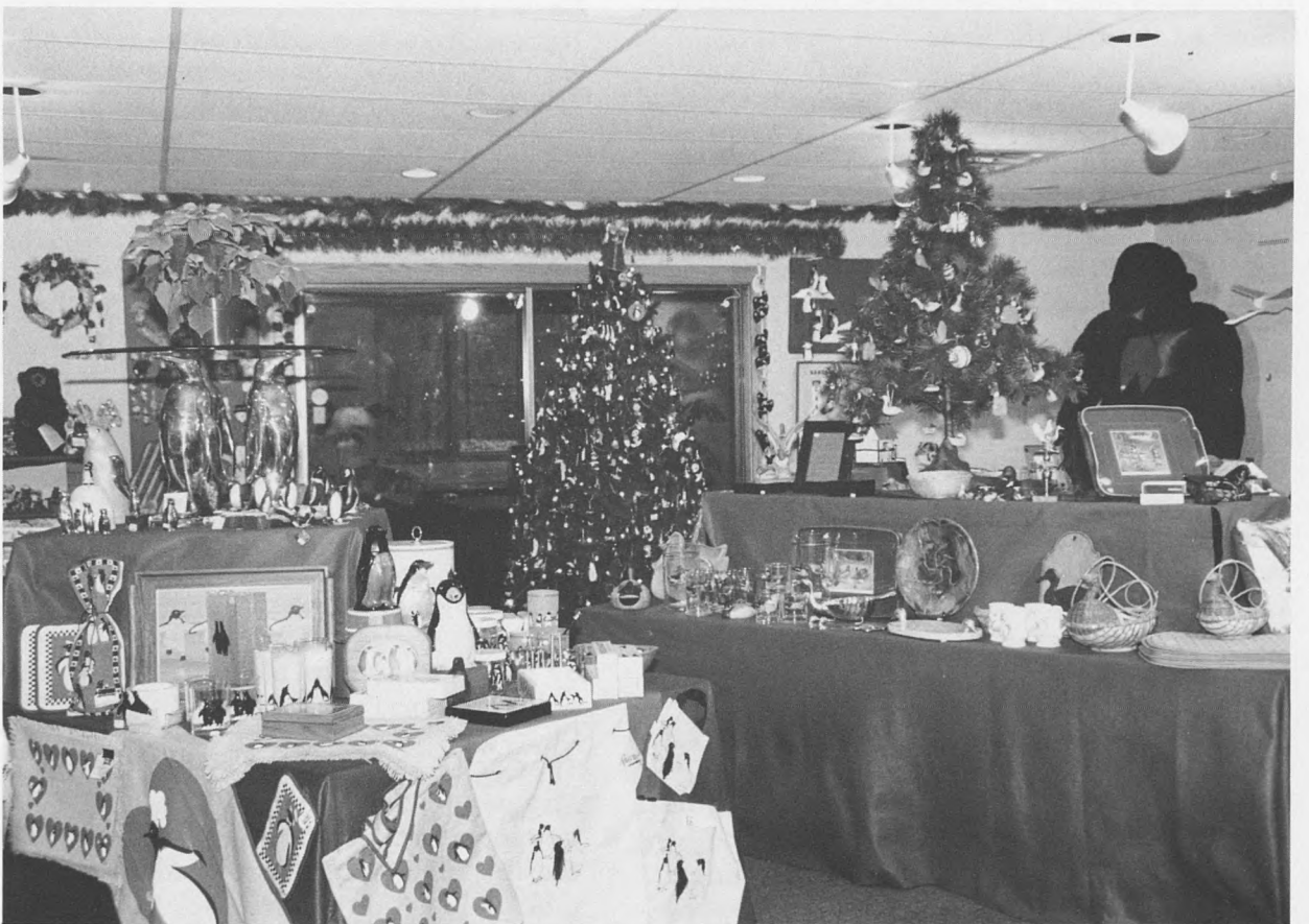
From penguins to pandas to Phil the Gorilla replicas, the Zoo-tique at the St. Louis Zoo at Forest Park offers something for all animal lovers. The Christmas boutique is operated by the Zoo Friends Association in the administration building and features ornaments, toys and novelty items for sale to benefit the zoo.