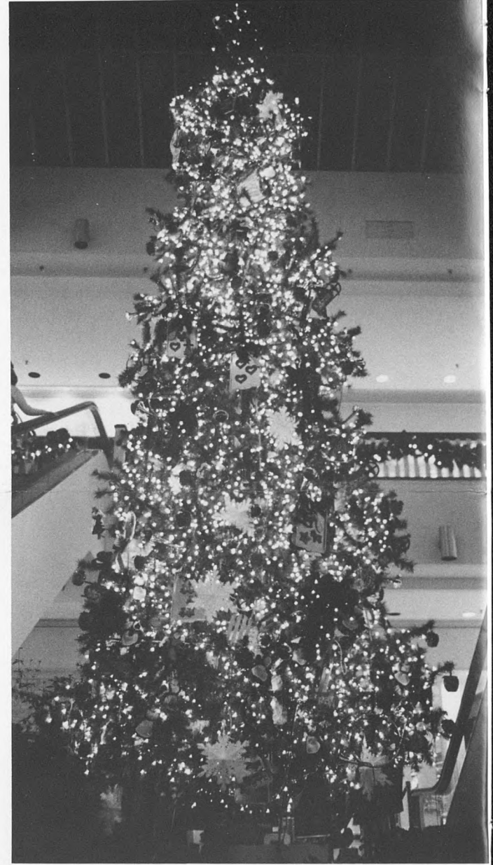
St. Louis shopping centers come alive with dazzling lights and festive displays. This magnificent 40-foot tree graces the lobby of Plaza Frontenac.