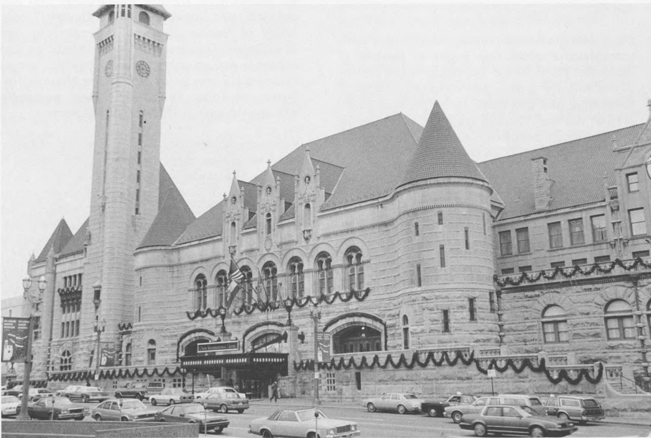
The majestic masonry of St. Louis Union Station is bedecked in holiday garland as the historic landmark once again bustles with activity. Though no longer used as a train depot, Union Station houses the Omni International Hotel and more than 100 restaurants, boutiques and specialty shops. The refurbished station reopened in August, 1985.