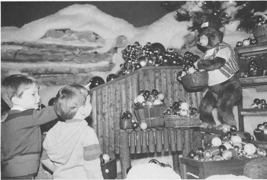
The magical enchantment of Santa Land at downtown Famous-Barr has delighted youngsters of all ages through the years. The popular children's attraction dates back to the 1930s.