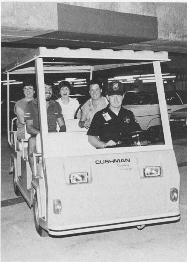
The new surrey transports visitors from their cars parked in the subsurface garage just south of Barnes to the walkway entrance to the hospital.

Barnes Hospital, St. Louis, Mo. September, 1985, Vol. 39, No. 9