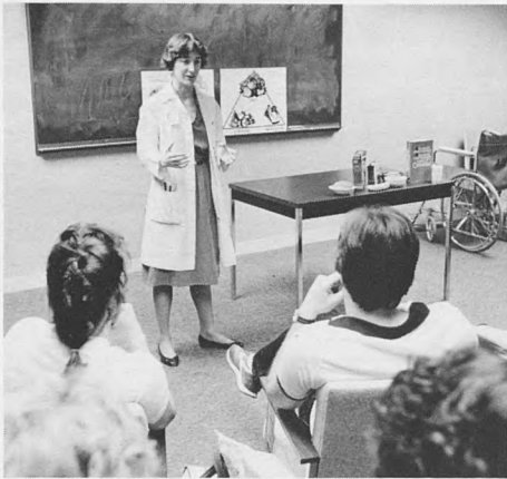
Diabetes education is an important component to overall patient treatment. Here, a registered dietitian explains diet and exercise plans during a class held for Barnes patients.

Education is an integral part of overall patient care. Through educational programs, patients can learn about diseases, their early warning signs, treatments and technological advancements which can offer hope for a cure or establishment of a more healthy lifestyle. By being informed, patients can play a more active role in their healthcare and treatment.