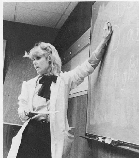
Daily classes are held to teach cardiac patients about their disease and its treatment. Here, a registered dietitian explains the importance of a balanced diet to overall care.