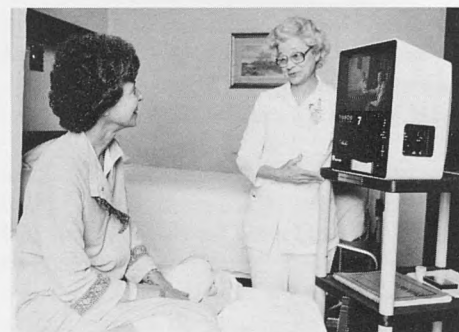
Diabetic patients can learn more about their disease through a filmstrip and printed materials available on the diabetes education cart.

p.m. in the center. The HESC staff relies on the vast expertise of Barnes doctors when further evaluation or treatment is needed.