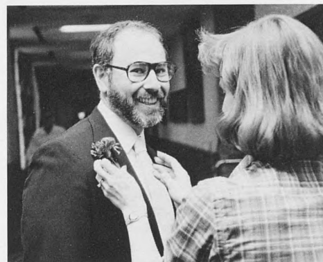
Barnes doctors were honored March 29 with complimentary doughnuts and a boutonniere as part of the Doctors' Day observance sponsored by the Barnes Auxiliary.