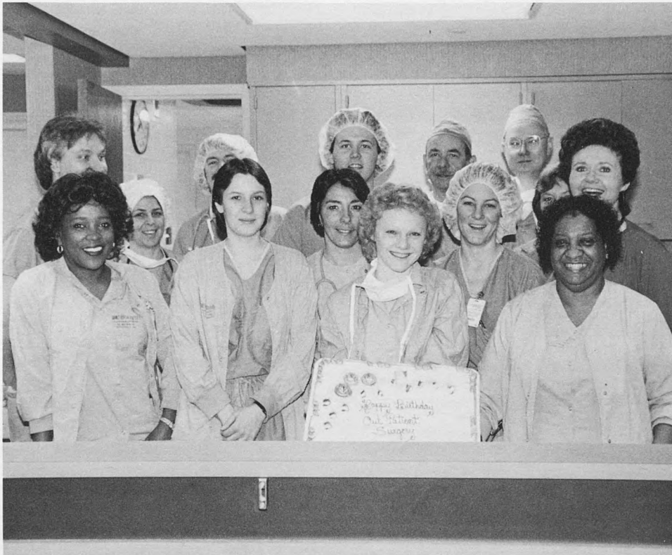
Nurses, doctors and staff members in the outpatient surgery center held a special birthday party in February honoring the center's first month in service.