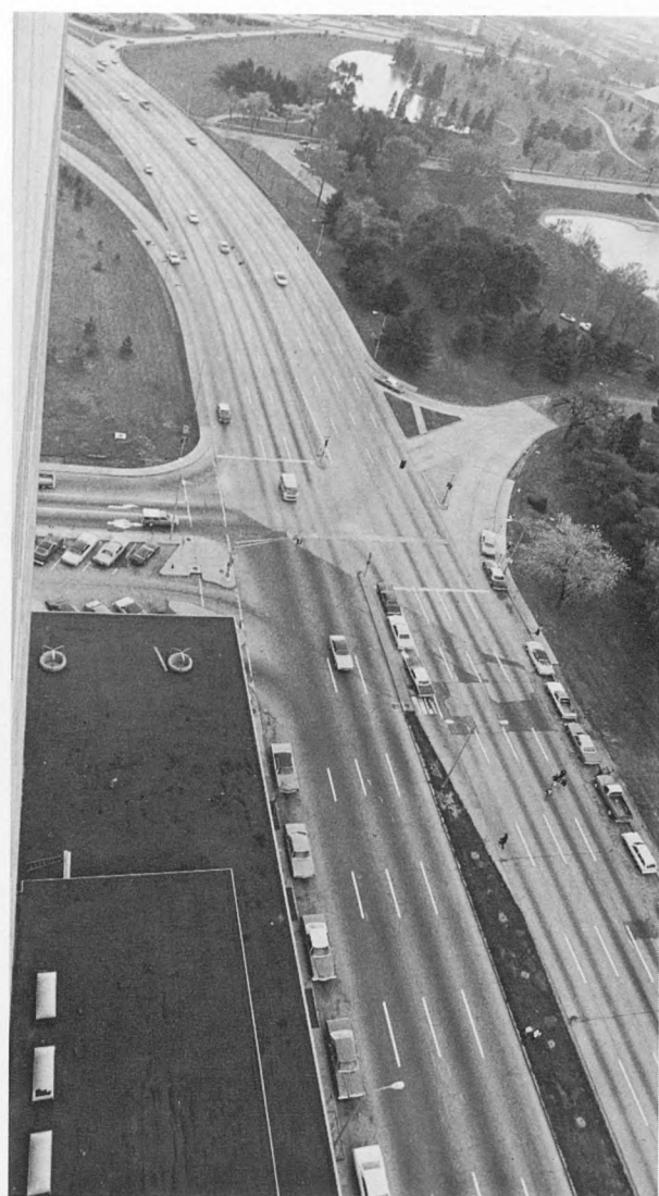
Kingshighway is expected to bear the major portion of an additional 40,000 cars a day by the year 1995 and plans are being made to improve traffic flow in the central west end area.