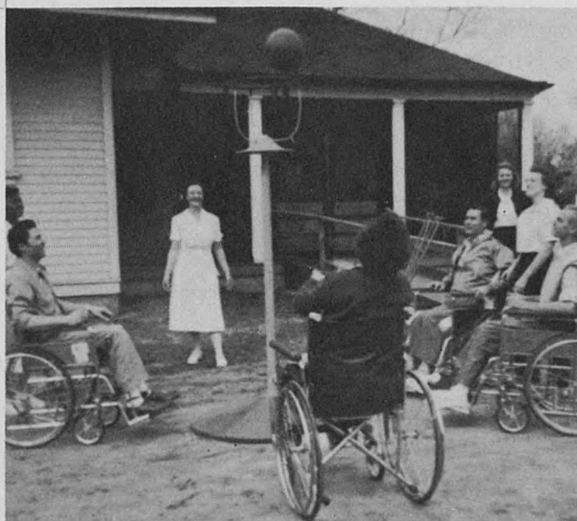
Miriam patients play wheel chair basketball.