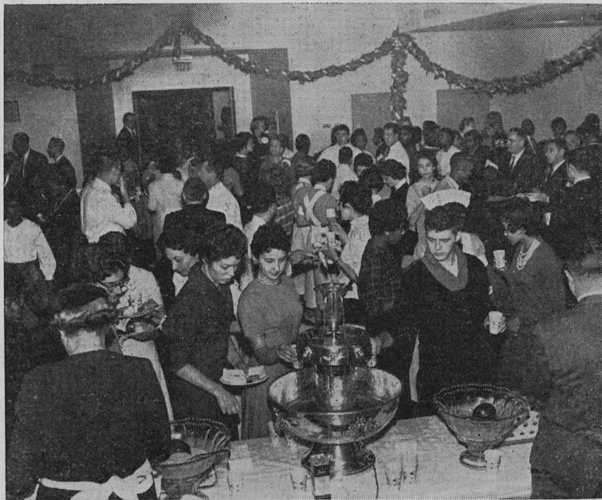
Hundreds Attend Annual Holiday Party (See Story, Page 4)

Forty-five volunteers at Jewish Hospital received awards for 500 or more total hours of service at a ceremony held on January 18 in the employees' dining room.